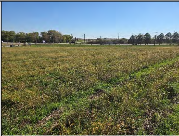
Date: 10/16/2025 Location: NW looking SE