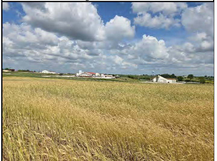
Date: 6/23/2025 Location: West looking East