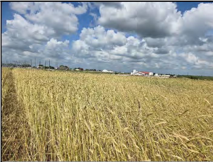
Date: 6/23/2025 Location: West looking NE