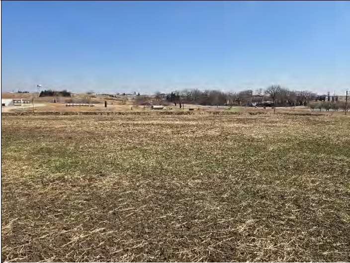
Date: 3/13/2025 Location: North side looking Southeast