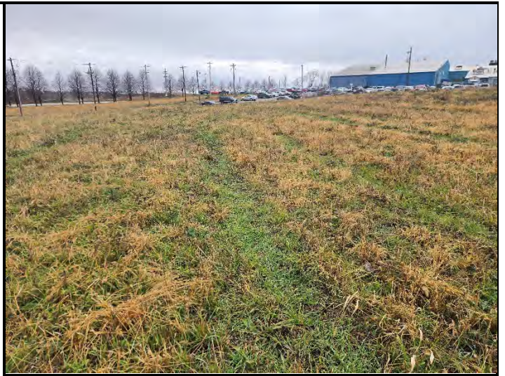
Date: 11/25/2025 Location: Middle looking SW