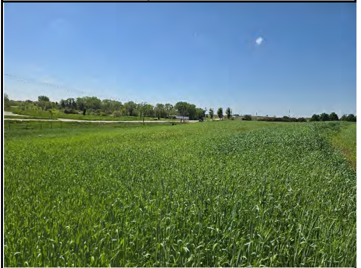
Date: 5/13/2025 Location: NE looking SE