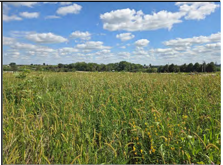
Date: 8/22/2025 Location: West looking East