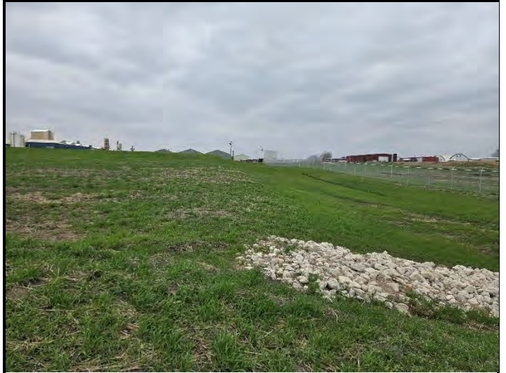
Date: 4/17/2025 Location: North looking West