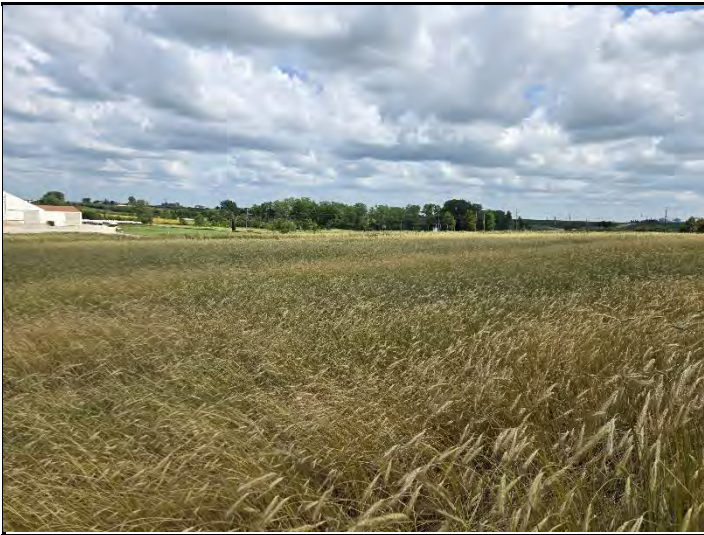
Date: 6/23/2025 Location: NW looking SE