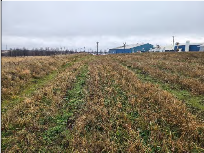
Date: 11/25/2025 Location: North looking South