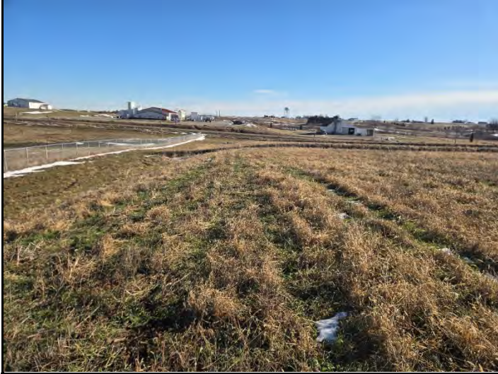
Date: 12/17/2025 Location: NW looking East