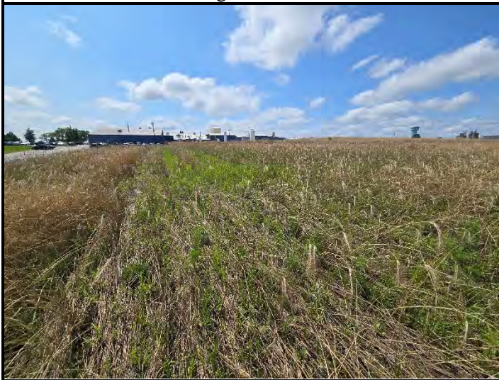
Date: 7/16/2025 Location: SE looking West