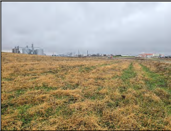
Date: 11/25/2025 Location: South looking NE