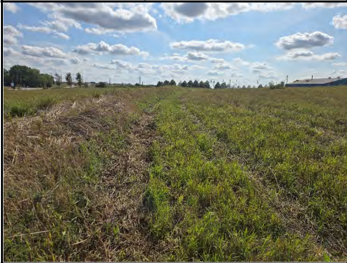
Date: 9/22/2025 Location: North looking South