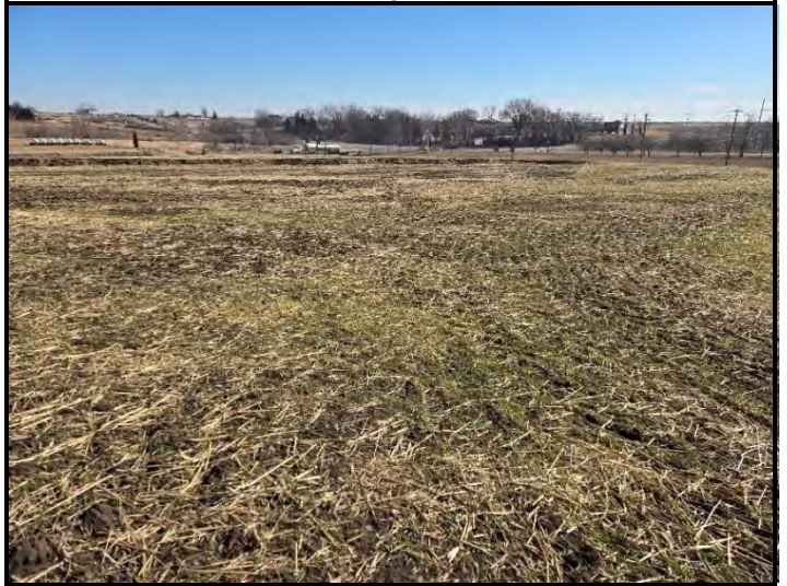
Date: 1/17/2025 Location: West side looking SE