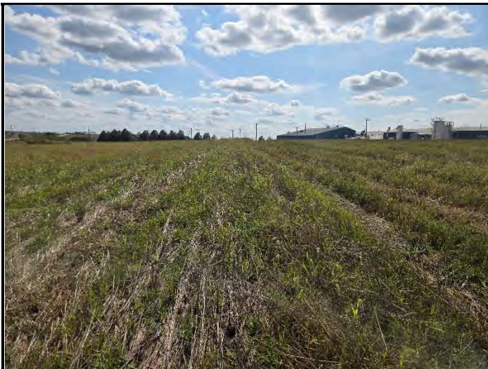
Date: 9/22/2025 Location: North looking South