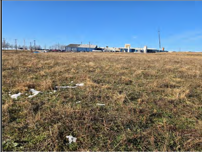
Date: 12/17/2025 Location: SE looking West