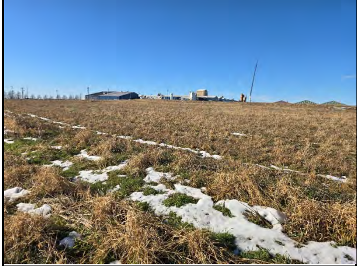
Date: 12/17/2025 Location: East looking West