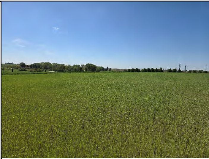
Date: 5/13/2025 Location: West looking SE