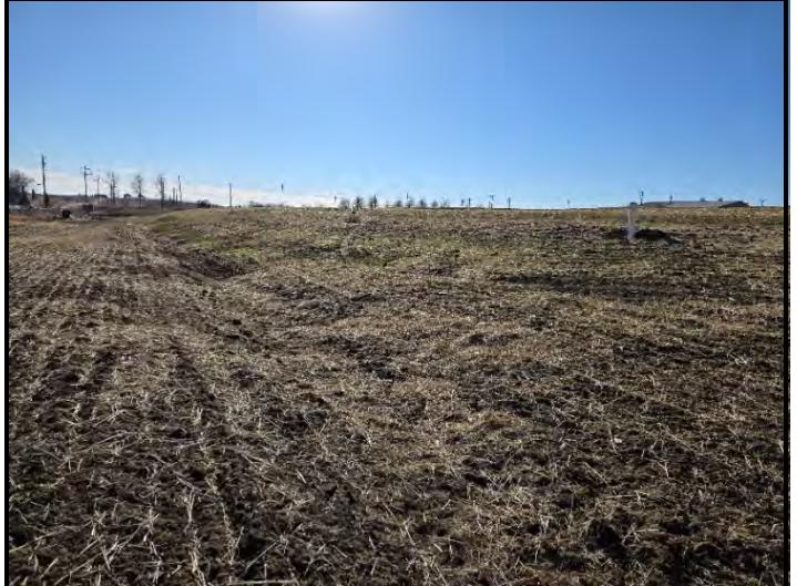
Date: 1/17/2025 Location: NE corner looking South