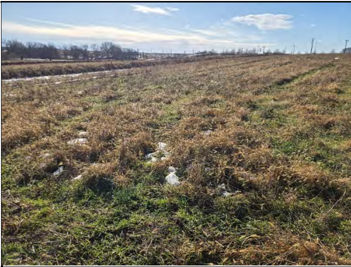
Date: 12/17/2025 Location: North looking South