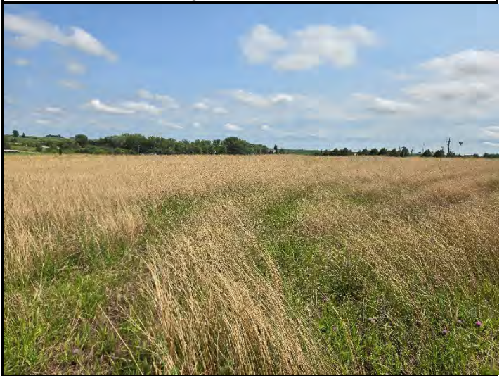
Date: 7/16/2025 Location: Middle looking South