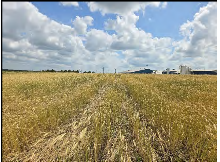
Date: 6/23/2025 Location: North looking SW