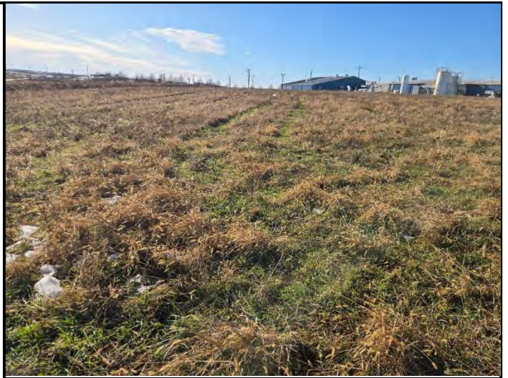
Date: 12/17/2025 Location: NE looking SW