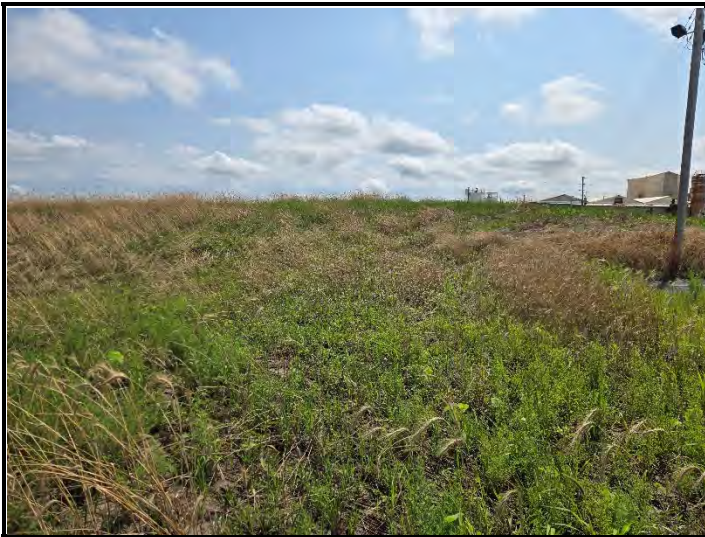
Date: 7/16/2025 Location: NW looking South