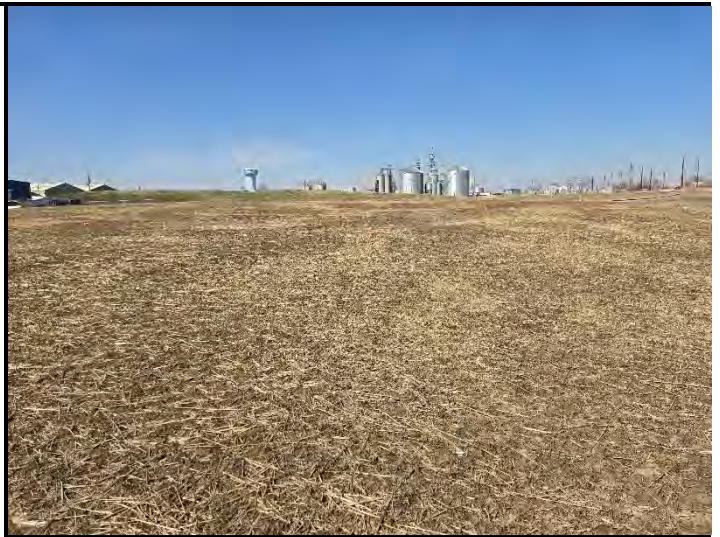
Date: 3/13/2025 Location: SW corner of West side looking North