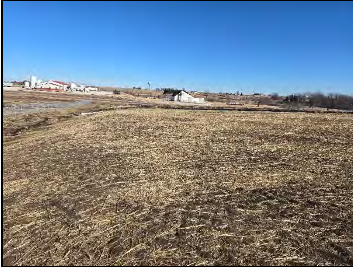
Date: 2/27/2025 Location: NW corner of West side looking East