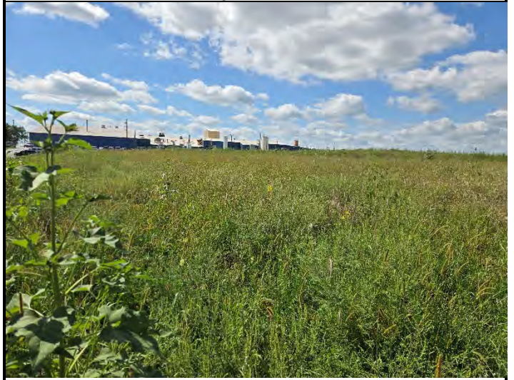
Date: 8/22/2025 Location: East looking West