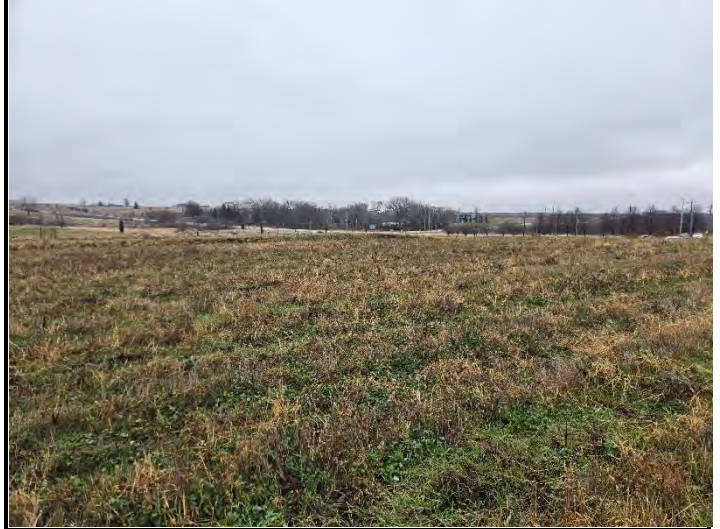
Date: 11/25/2025 Location: Middle looking SE