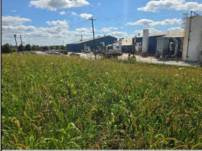
Date: 8/22/2025 Location: NW looking South