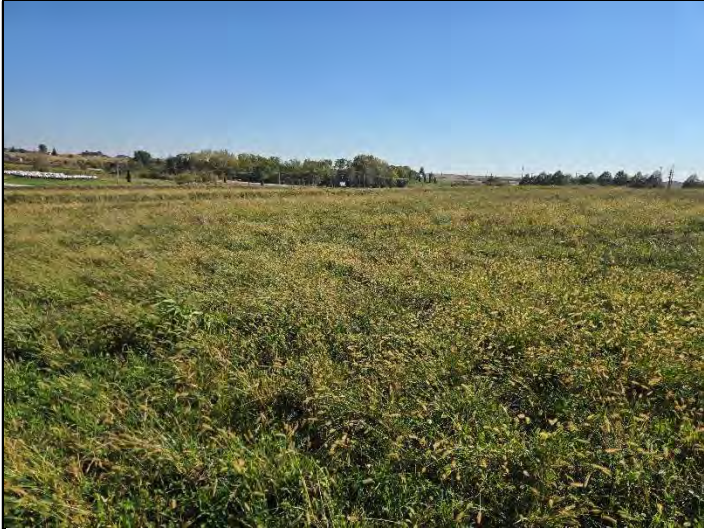
Date: 10/16/2025 Location: Middle looking SE