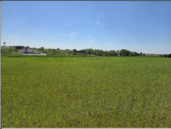
Date: 5/13/2025 Location: West looking East