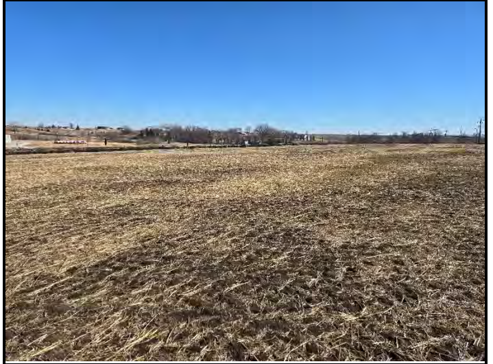
Date: 2/27/2025 Location: North side looking SE