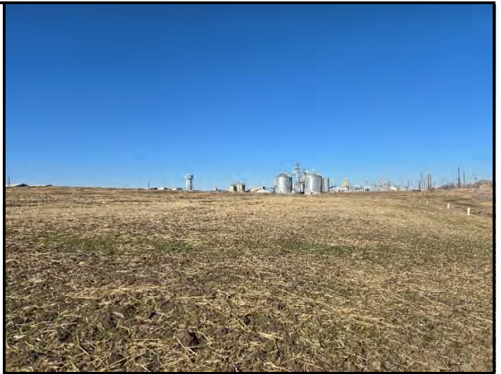
Date: 1/17/2025 Location: SE corner looking North