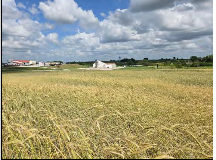
Date: 6/23/2025 Location: West looking East