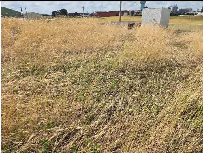
Date: 6/23/2025 Location: West