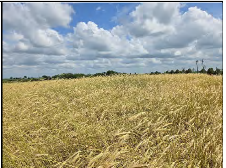
Date: 6/23/2025 Location: West looking SE