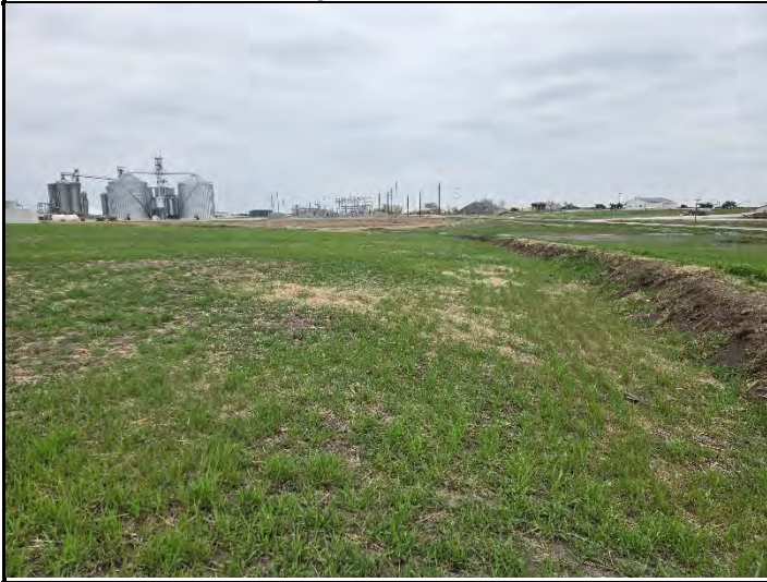
Date: 4/17/2025 Location: South looking North