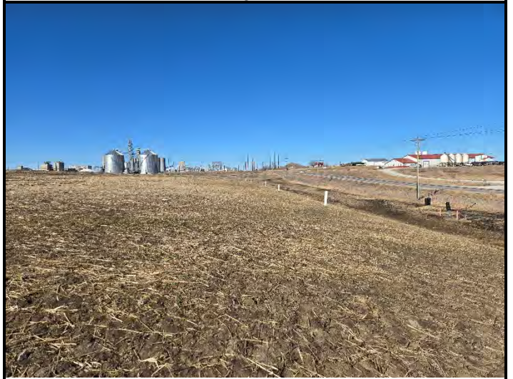
Date: 2/27/2025 Location: SE corner looking North