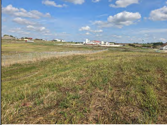
Date: 9/22/2025 Location: NW looking East