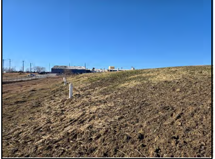
Date: 1/17/2025 Location: SE corner looking West