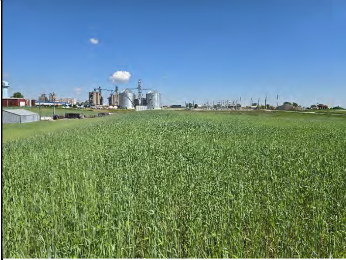
Date: 5/13/2025 Location: SW looking North