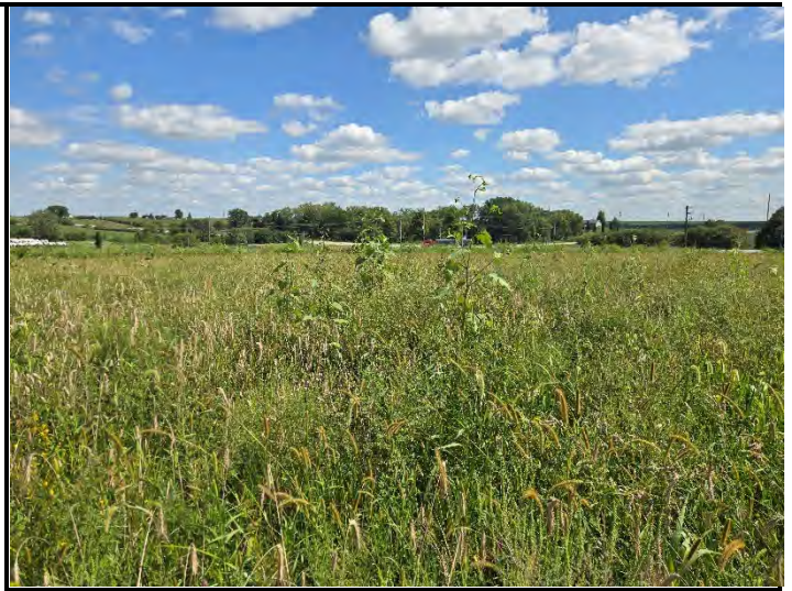
Date: 8/22/2025 Location: Middle looking SE