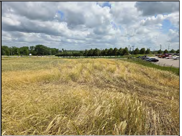
Date: 6/23/2025 Location: NW looking South