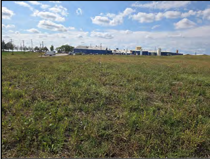
Date: 9/22/2025 Location: SE looking West