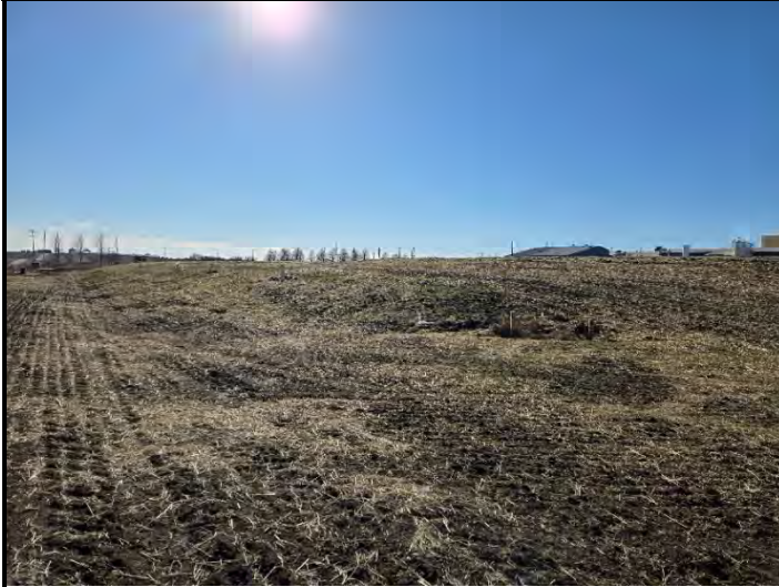
Date: 1/17/2025 Location: NE corner looking SW