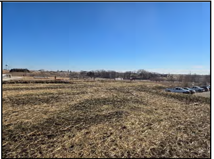
Date: 1/17/2025 Location: NW corner looking East