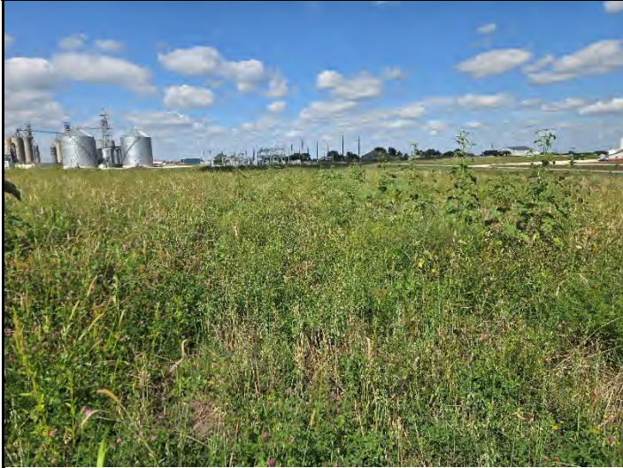
Date: 8/22/2025 Location: Middle looking North