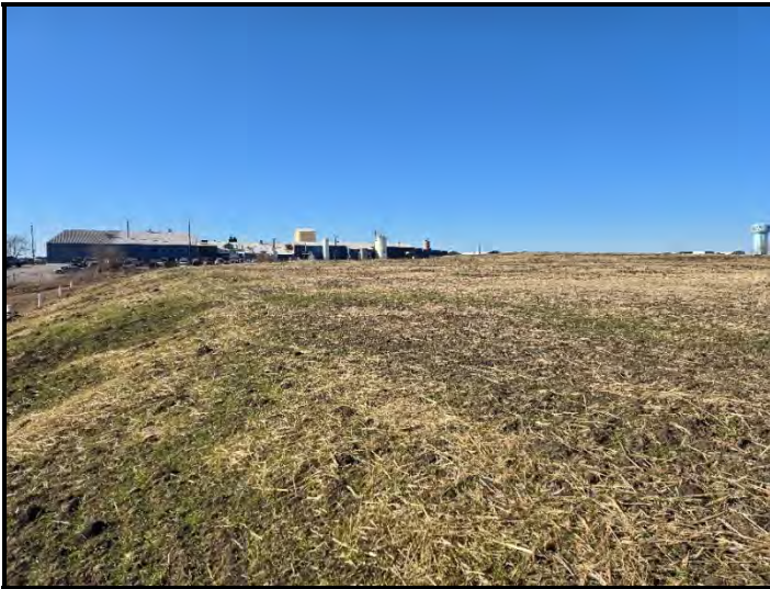
Date: 1/17/2025 Location: SE corner looking West