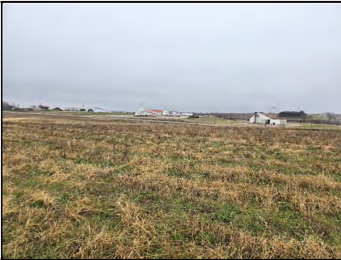
Date: 11/25/2025 Location: West looking East