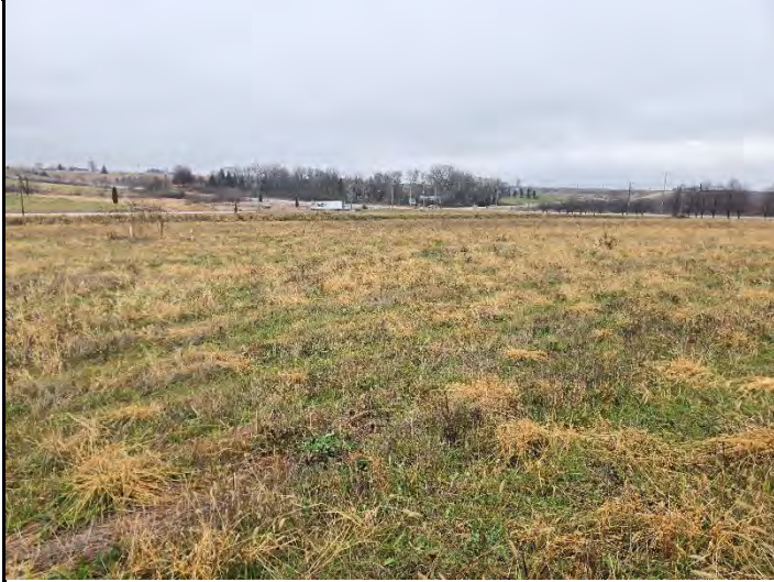
Date: 11/25/2025 Location: North looking SE