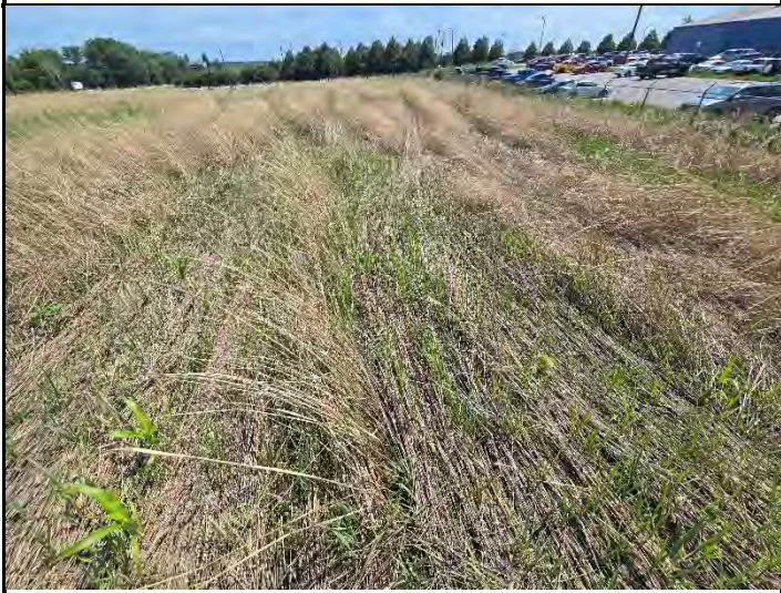
Date: 7/16/2025 Location: North looking South