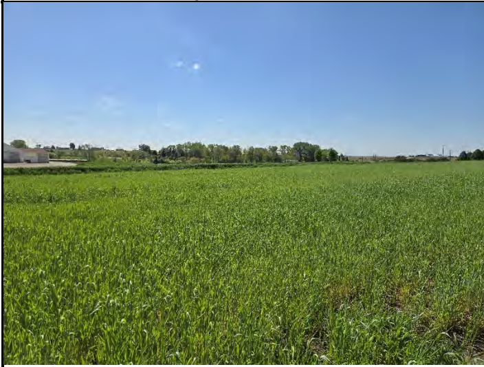
Date: 5/13/2025 Location: North looking SE