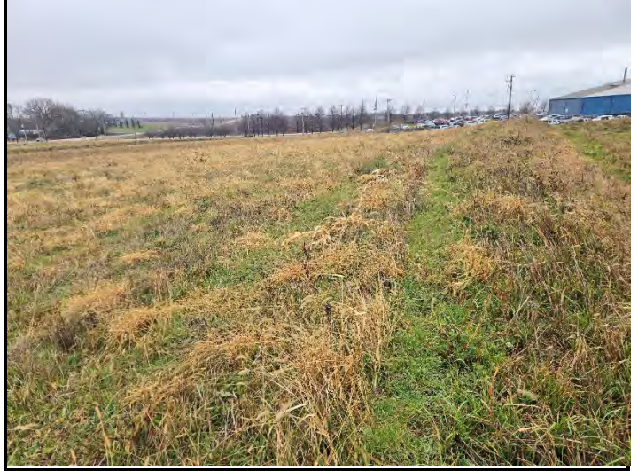
Date: 11/25/2025 Location: North looking South