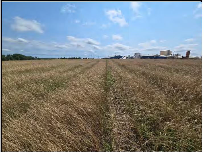
Date: 7/16/2025 Location: NE looking SW