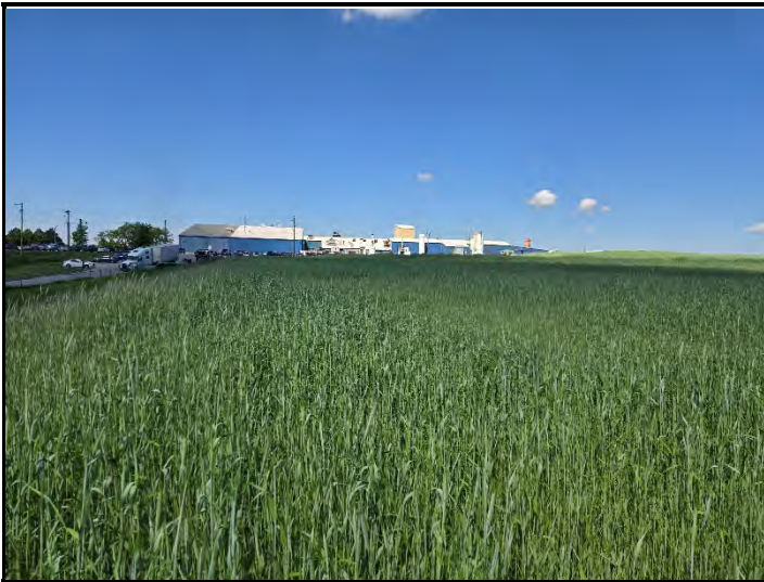
Date: 5/13/2025 Location: SE looking West