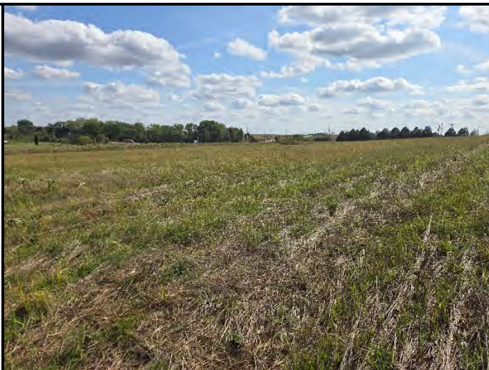
Date: 9/22/2025 Location: NW looking SE