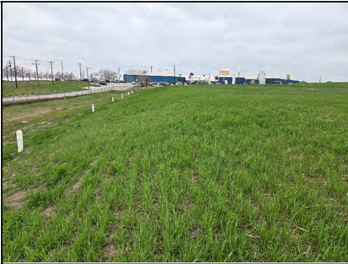
Date: 4/17/2025 Location: SE corner looking West