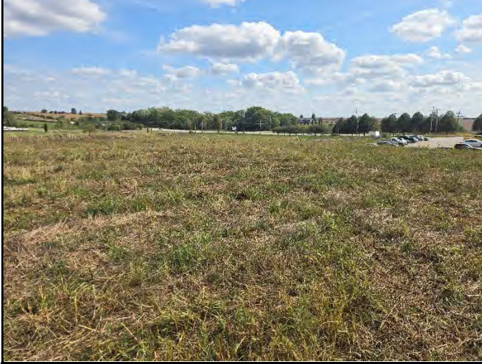
Date: 9/22/2025 Location: NW looking SE