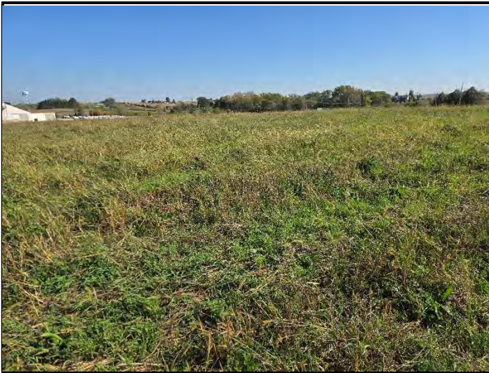
Date: 10/16/2025 Location: West looking east