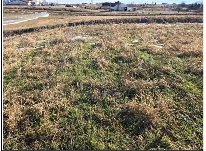
Date: 12/17/2025 Location: Middle looking East