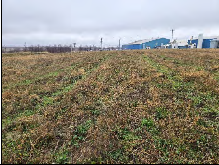
Date: 11/25/2025 Location: NW looking SW