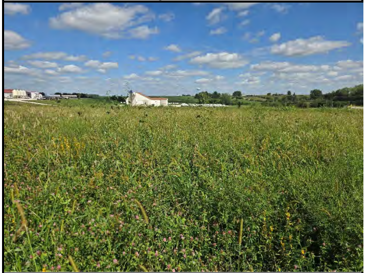
Date: 8/22/2025 Location: Middle looking East