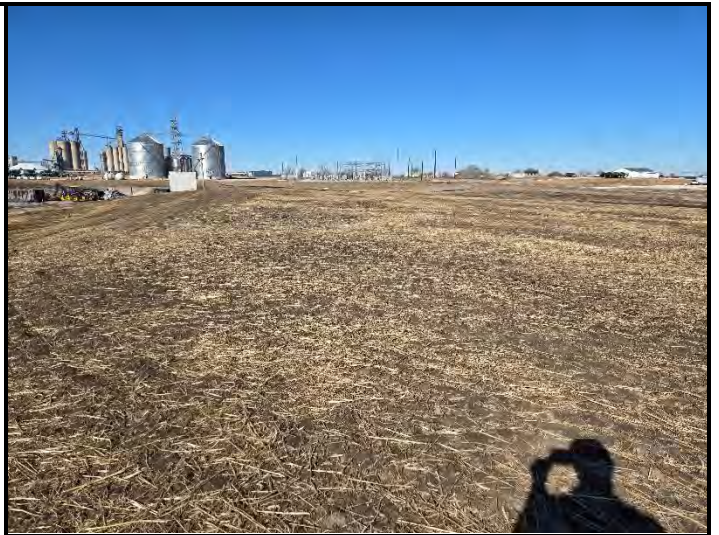
Date: 2/27/2025 Location: SW corner of West side looking North