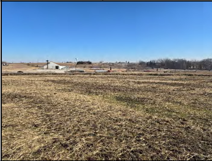
Date: 1/17/2025 Location: West side looking East