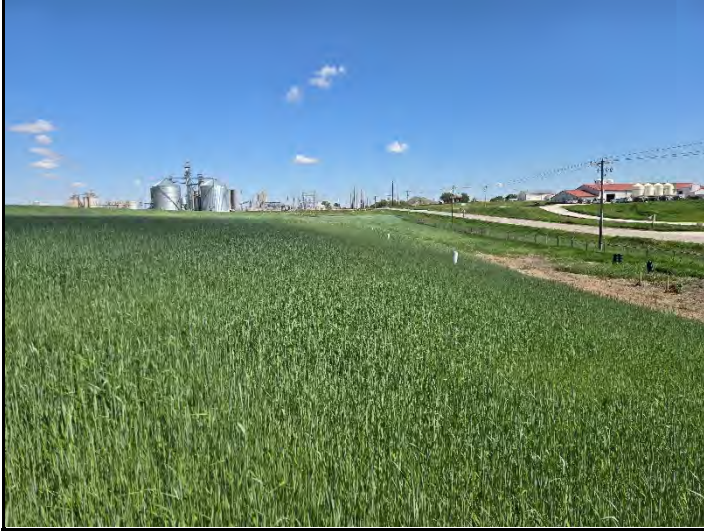
Date: 5/13/2025 Location: SE looking North