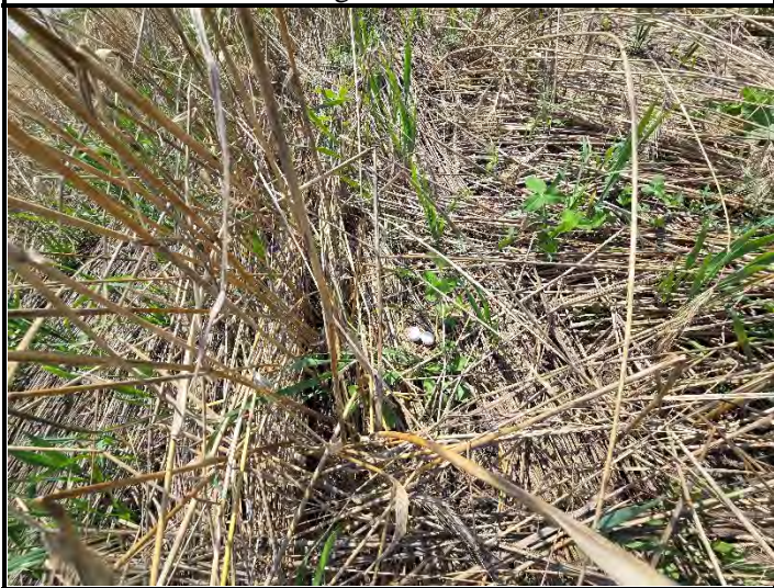
Date: 7/16/2025 Location: Middle