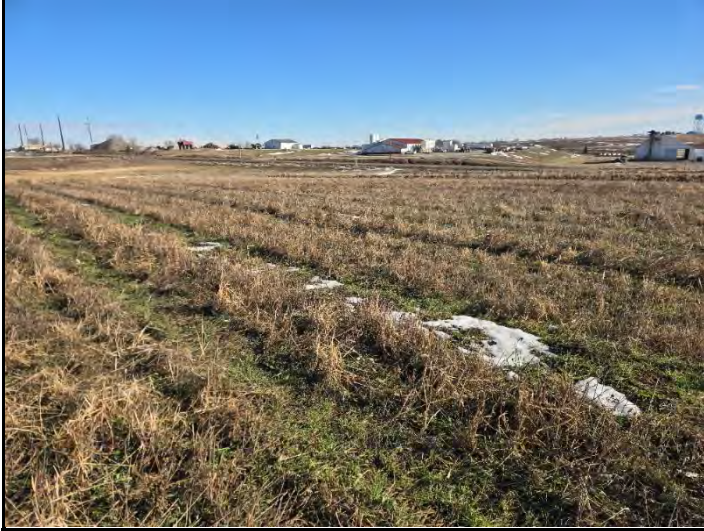
Date: 12/17/2025 Location: SW looking NE