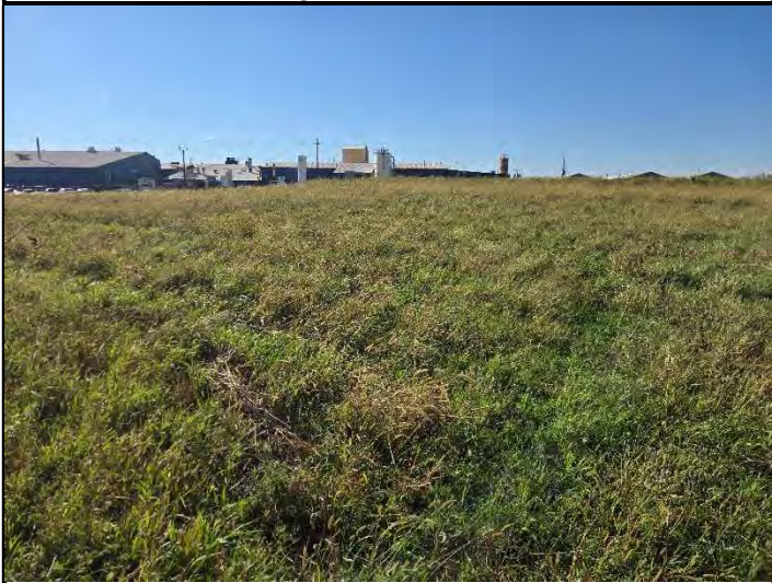
Date: 10/16/2025 Location: East looking West