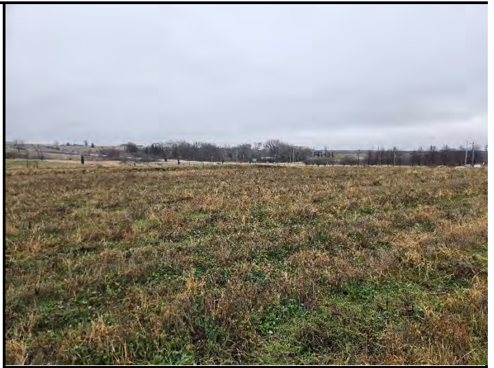
Date: 11/25/2025 Location: West looking SE