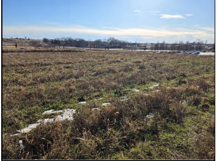
Date: 12/17/2025 Location: West looking SE