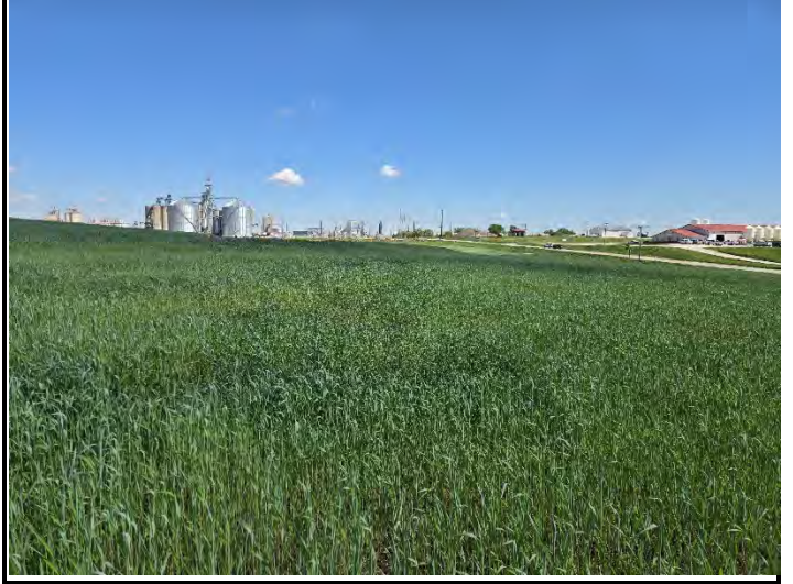
Date: 5/13/2025 Location: South looking North