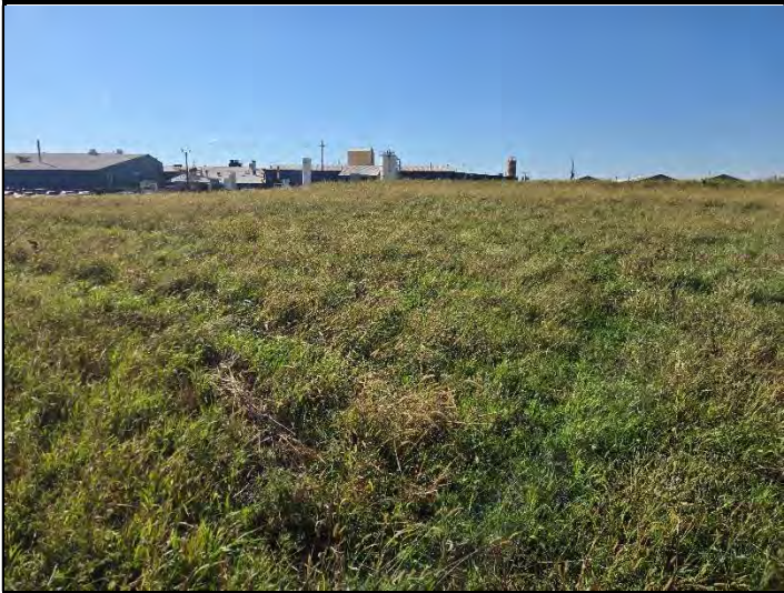
Date: 10/16/2025 Location: East looking West