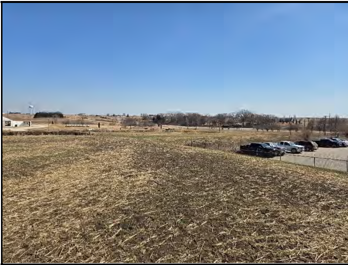
Date: 3/13/2025 Location: SW corner on West side corner looking SE