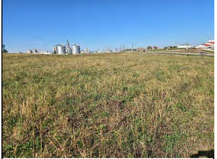
Date: 10/16/2025 Location: South looking North