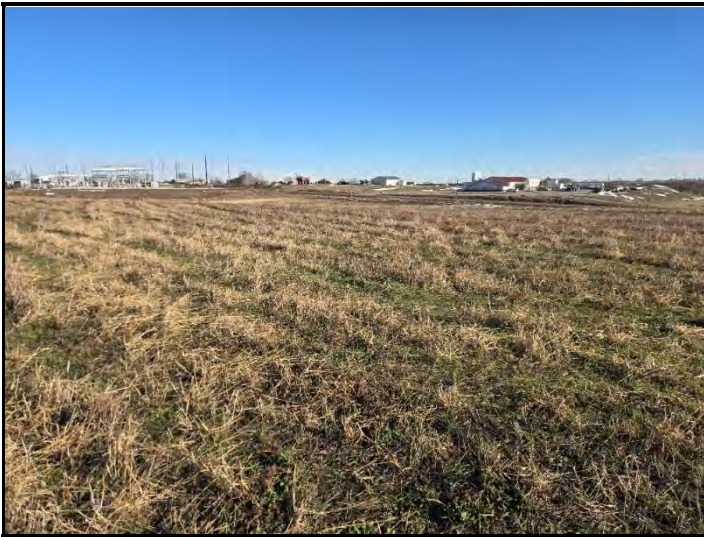
Date: 12/17/2025 Location: West looking NE