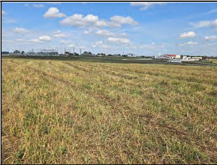
Date: 9/22/2025 Location: SW looking NE