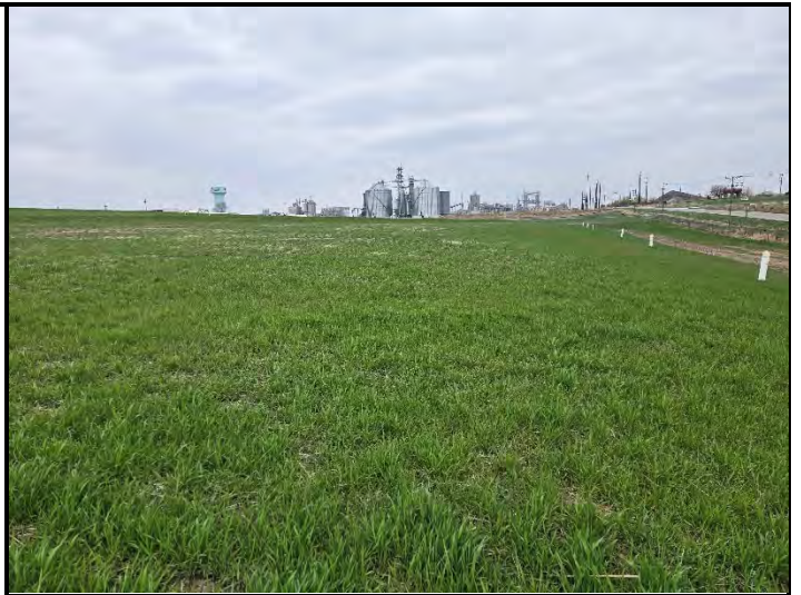
Date: 4/17/2025 Location: SE corner looking North