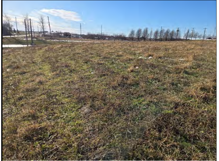
Date: 12/17/2025 Location: East looking South