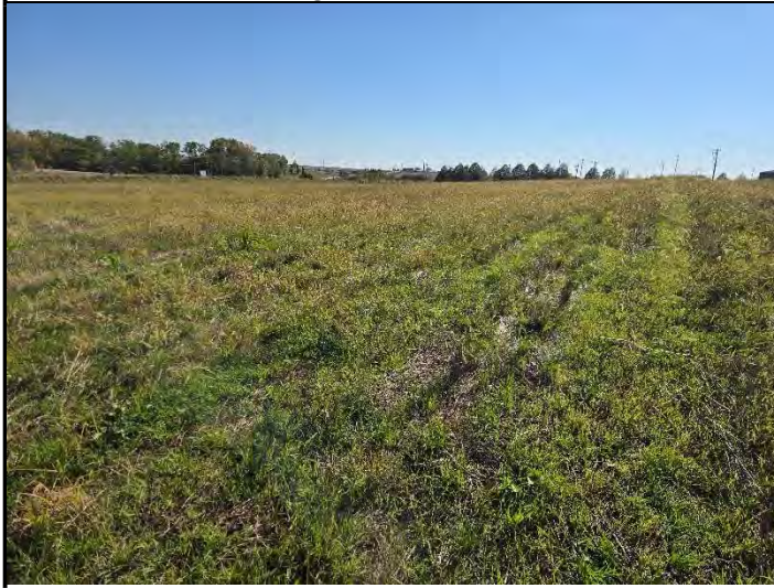
Date: 10/16/2025 Location: North looking South