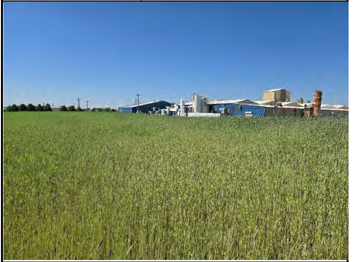
Date: 5/13/2025 Location: North looking SW