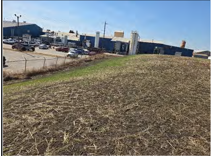
Date: 3/13/2025 Location: Southside looking West