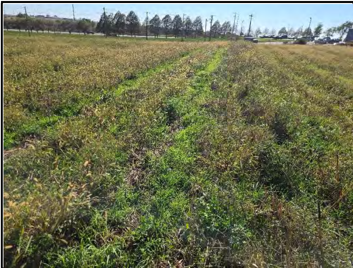
Date: 10/16/2025 Location: NW looking South