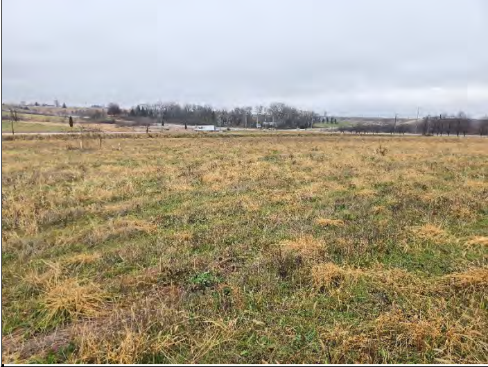
Date: 11/25/2025 Location: Middle looking East