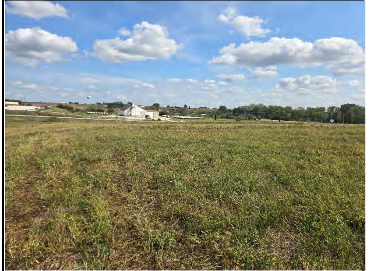
Date: 9/22/2025 Location: Middle looking East