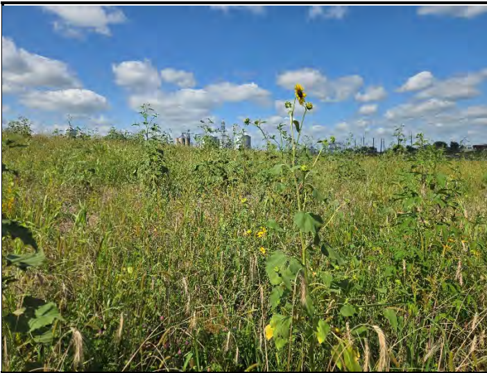
Date: 8/22/2025 Location: South looking North