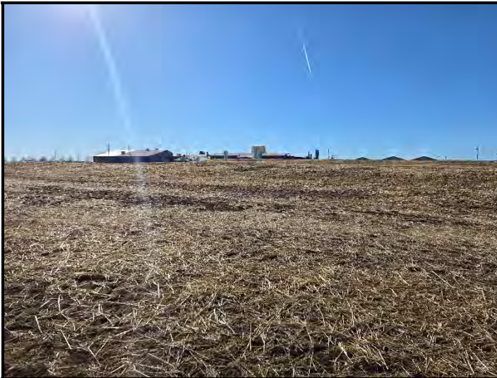
Date: 2/27/2025 Location: NE corner looking SW