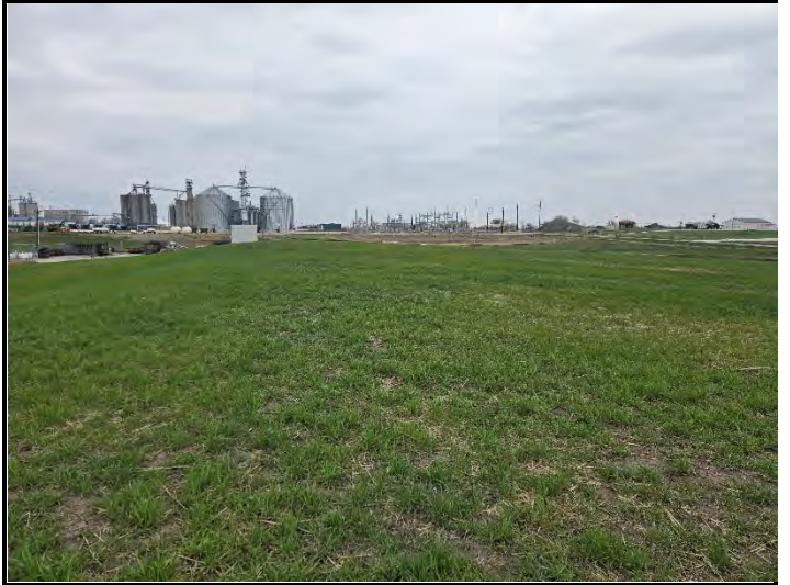
Date: 4/17/2025 Location: SW looking NE