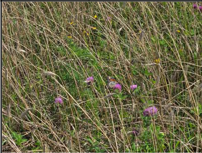
Date: 7/16/2025 Location: Middle