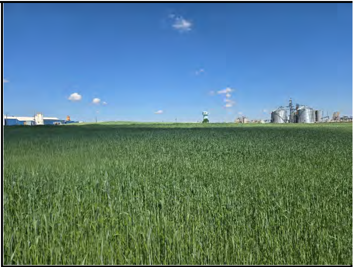
Date: 5/13/2025 Location: SE looking NW