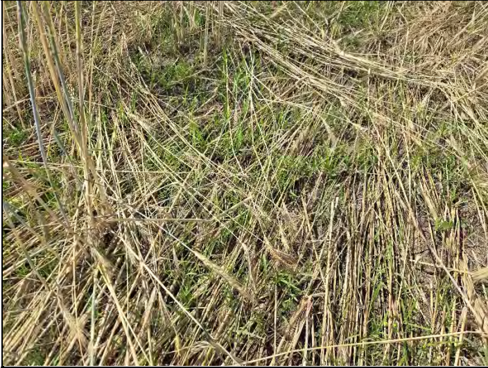
Date: 6/23/2025 Location: Ground level