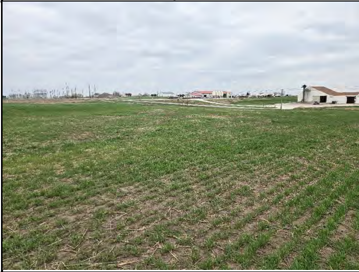
Date: 4/17/2025 Location: South looking NE