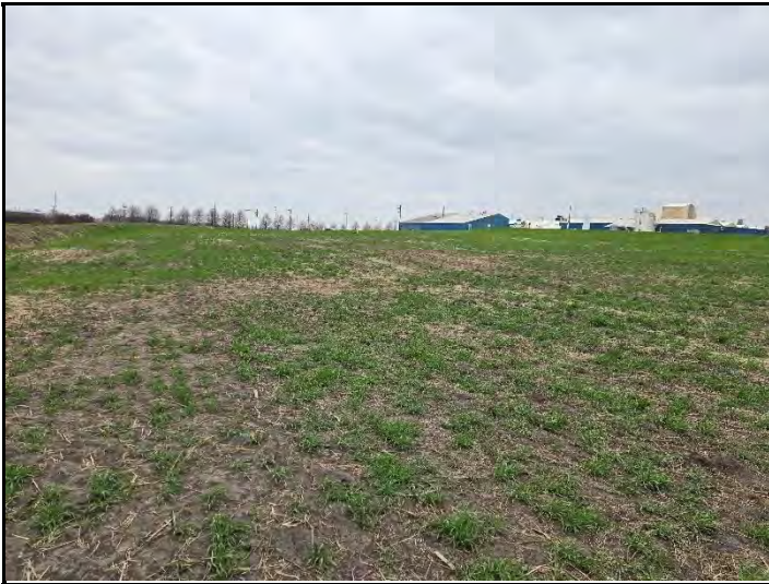
Date: 4/17/2025 Location: North looking SW