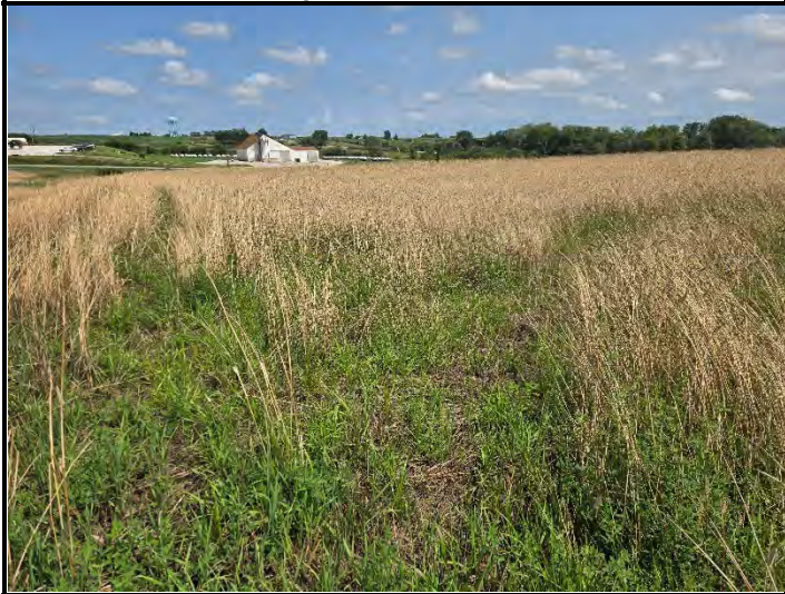
Date: 7/16/2025 Location: Middle looking East