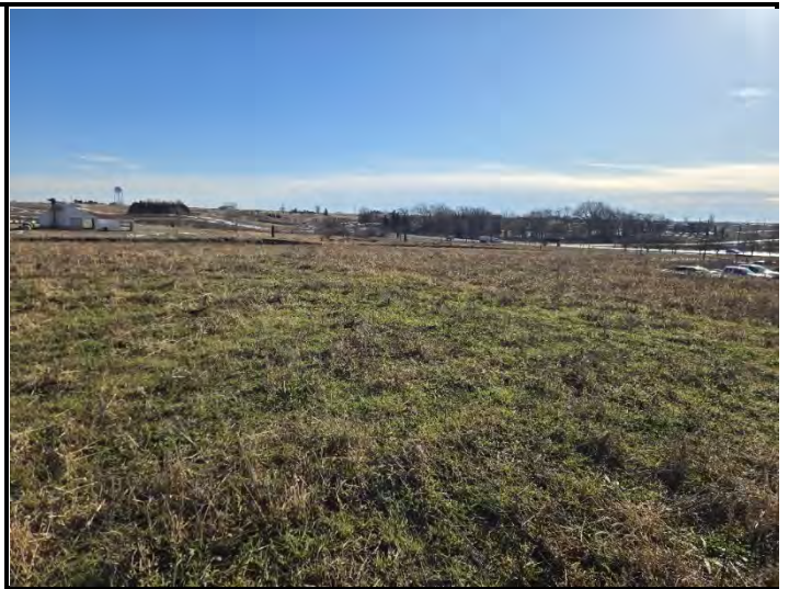
Date: 12/17/2025 Location: West looking East