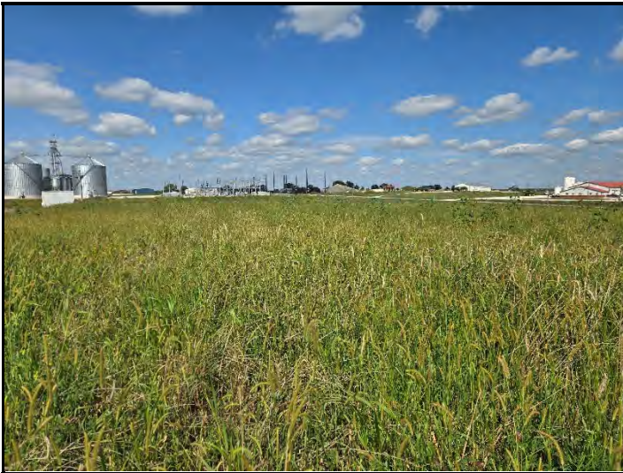
Date: 8/22/2025 Location: SW looking North