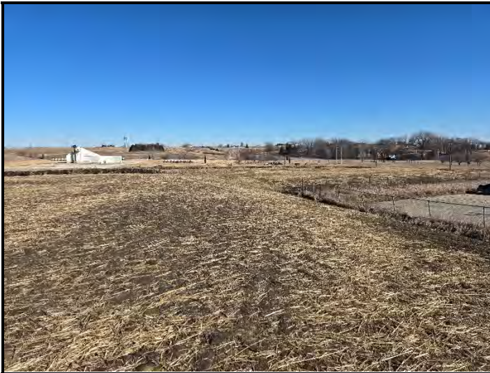
Date: 2/27/2025 Location: SW corner on West side corner looking SE