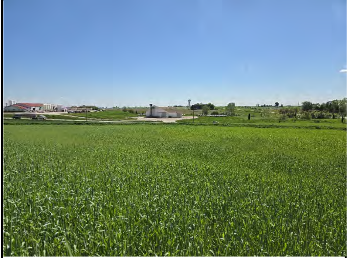
Date: 5/13/2025 Location: SW looking East