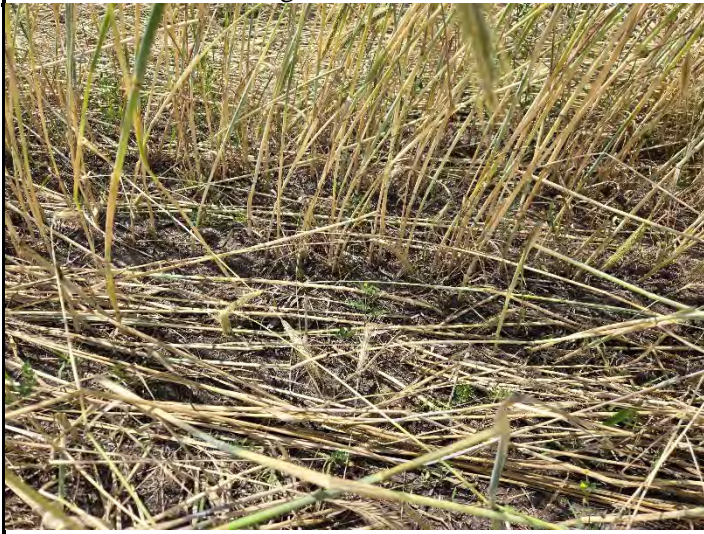
Date: 6/23/2025 Location: Middle