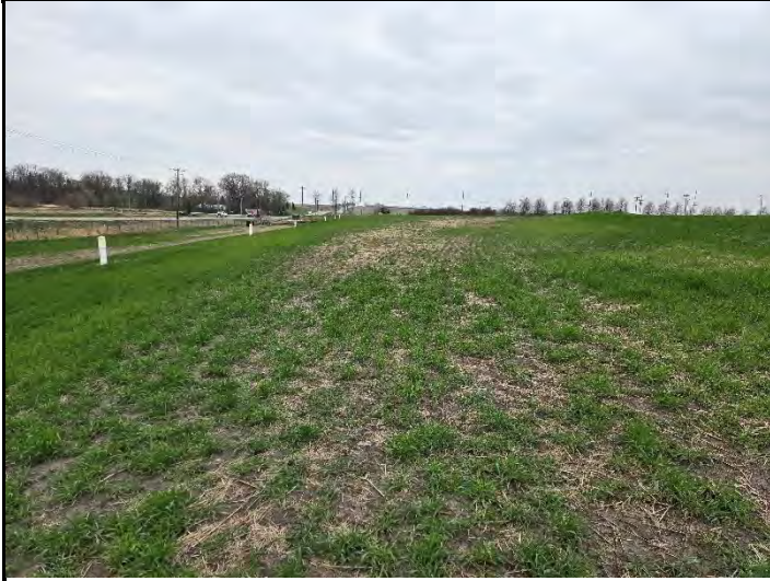
Date: 4/17/2025 Location: NE corner looking South