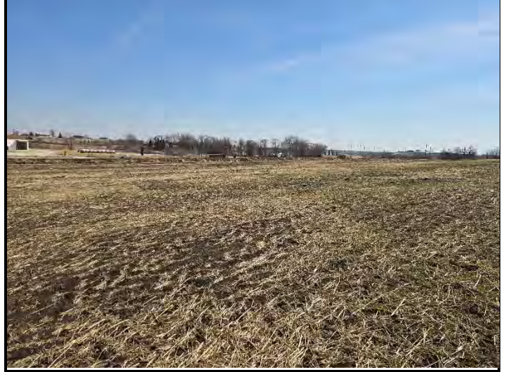
Date: 3/13/2025 Location: Northwest looking Southwest