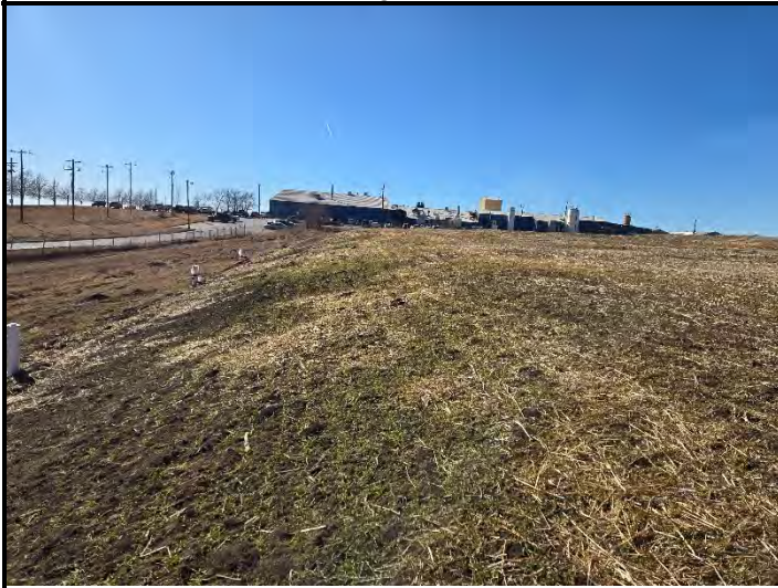
Date: 2/27/2025 Location: SE corner looking West