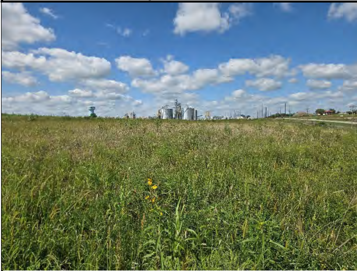
Date: 8/22/2025 Location: South looking North