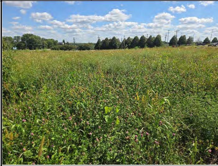
Date: 8/22/2025 Location: North looking South