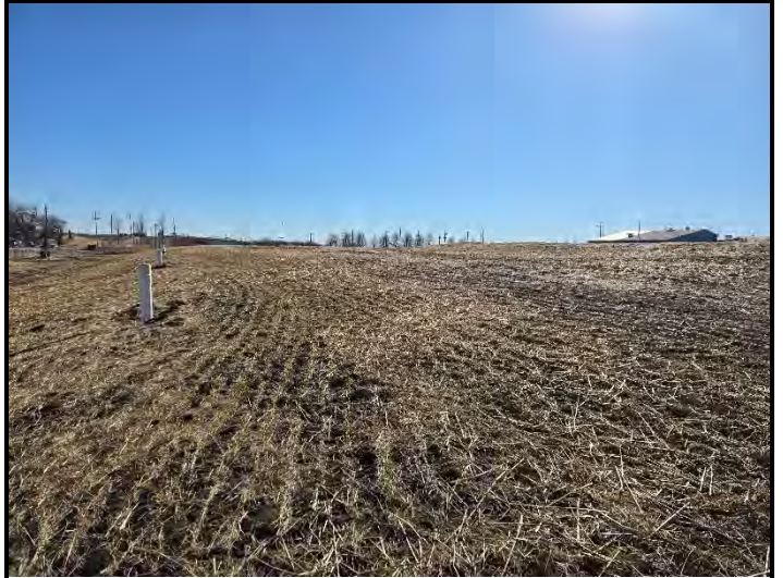
Date: 2/27/2025 Location: NE corner looking South