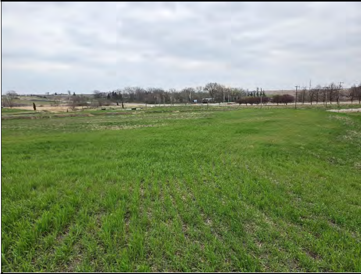
Date: 4/17/2025 Location: West looking SE