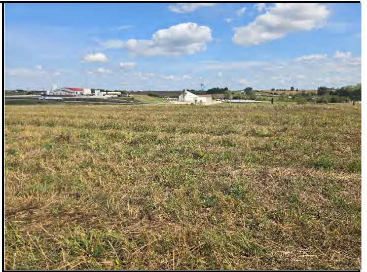
Date: 9/22/2025 Location: West looking East