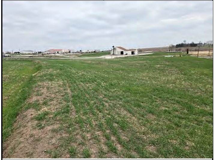
Date: 4/17/2025 Location: South looking East