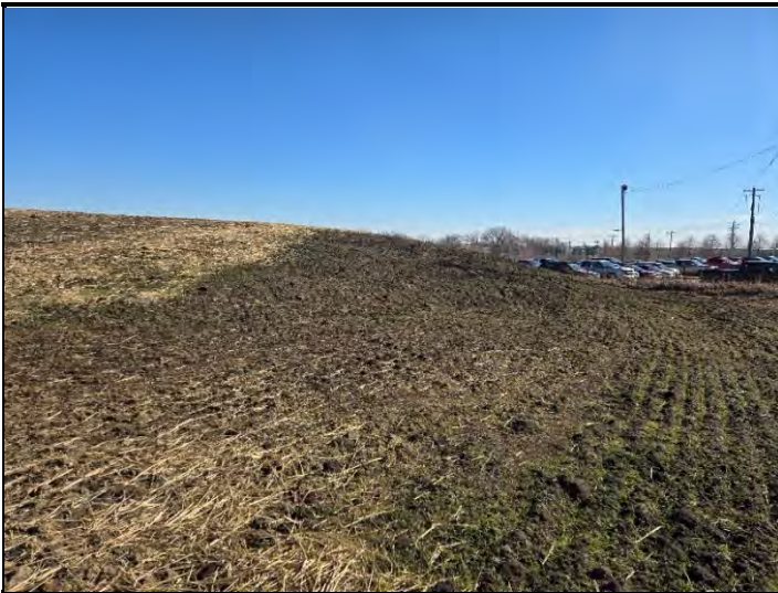
Date: 1/17/2025 Location: NW corner looking SE