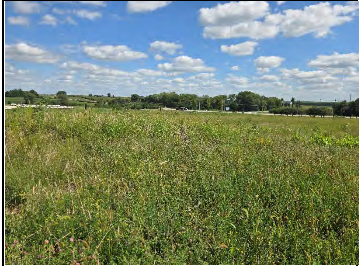
Date: 8/22/2025 Location: Middle looking East