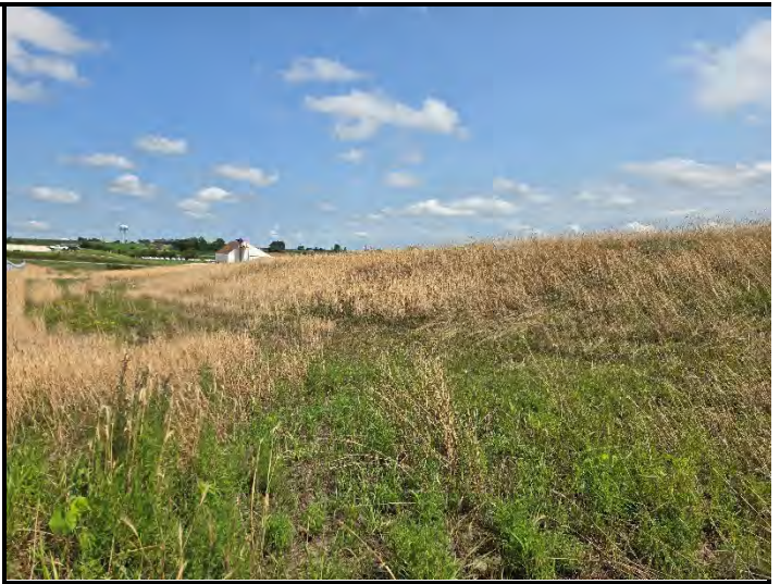
Date: 7/16/2025 Location: NW looking East