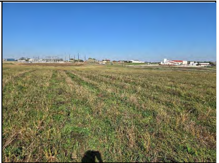
Date: 10/16/2025 Location: SW looking NE