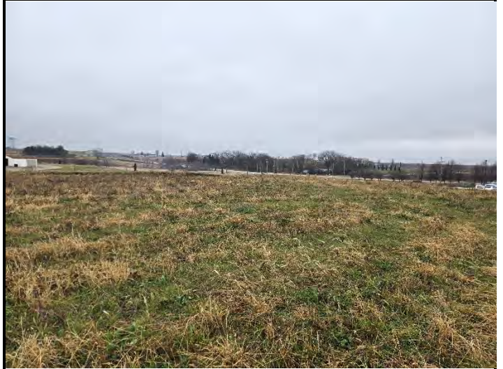
Date: 11/25/2025 Location: Middle looking East