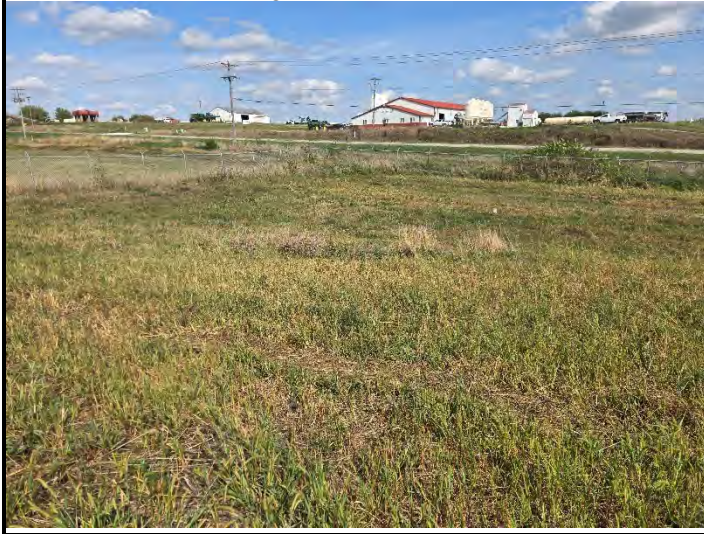
Date: 9/22/2025 Location: Middle looking East