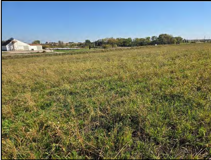
Date: 10/16/2025 Location: West looking East