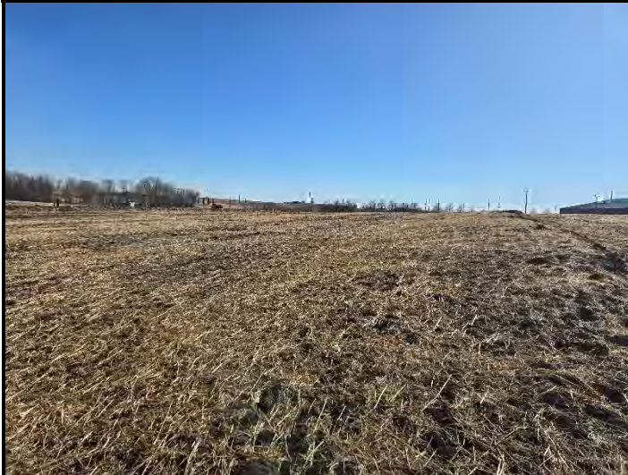
Date: 2/27/2025 Location: North side looking South