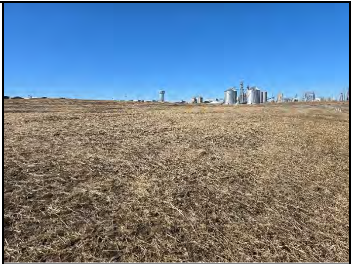
Date: 2/27/2025 Location: SE corner looking NW