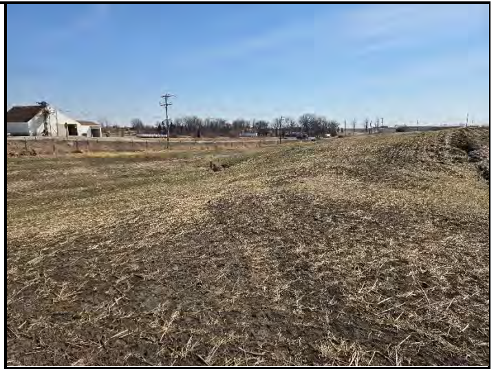
Date: 3/13/2025 Location: Northeast corner looking South