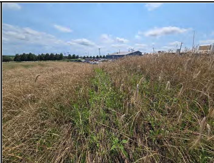
Date: 7/16/2025 Location: Middle looking SW