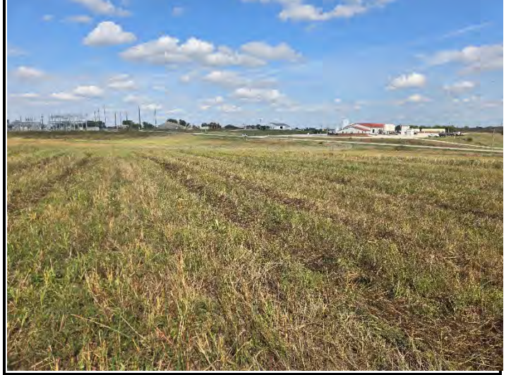
Date: 9/22/2025 Location: West looking NE