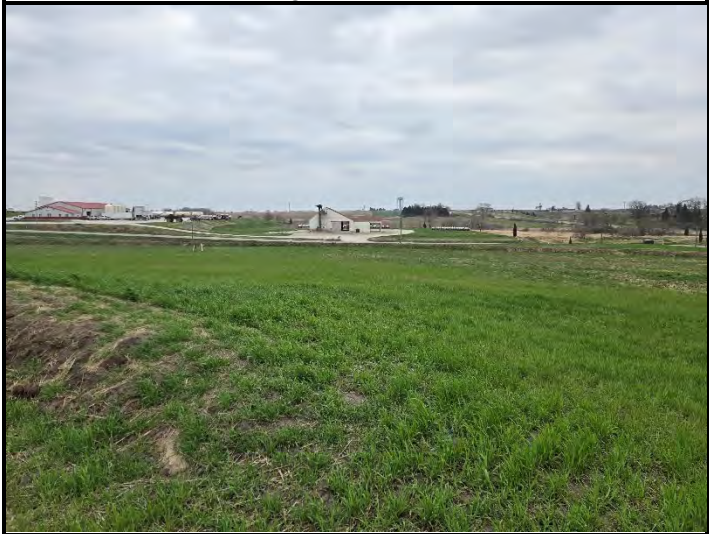
Date: 4/17/2025 Location: SW looking East