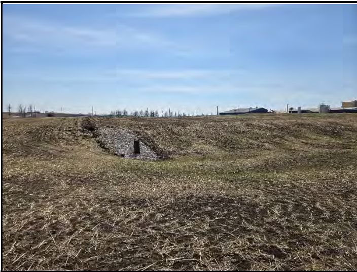
Date: 3/13/2025 Location: Northeast corner looking Southwest