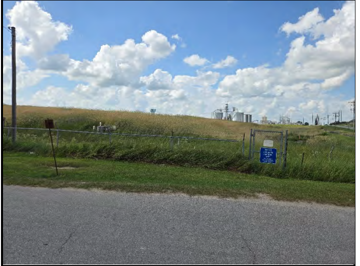
Date: 6/23/2025 Location: East drive looking North