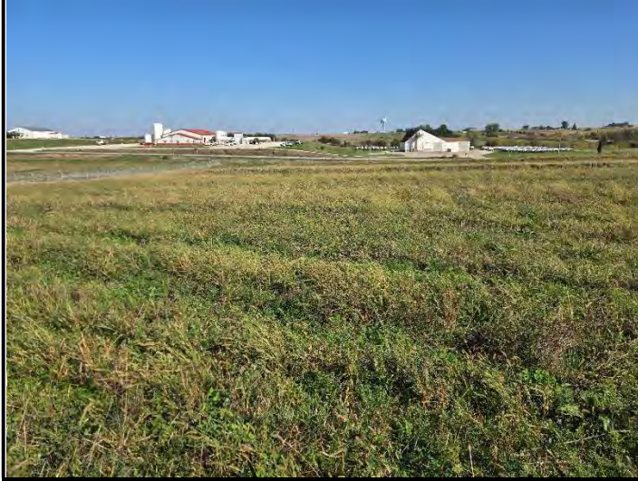
Date: 10/16/2025 Location: NW looking East