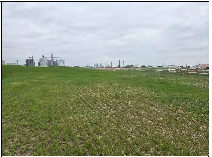
Date: 4/17/2025 Location: South looking North