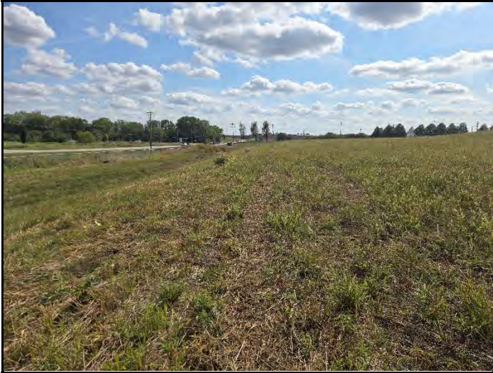
Date: 9/22/2025 Location: NE looking South