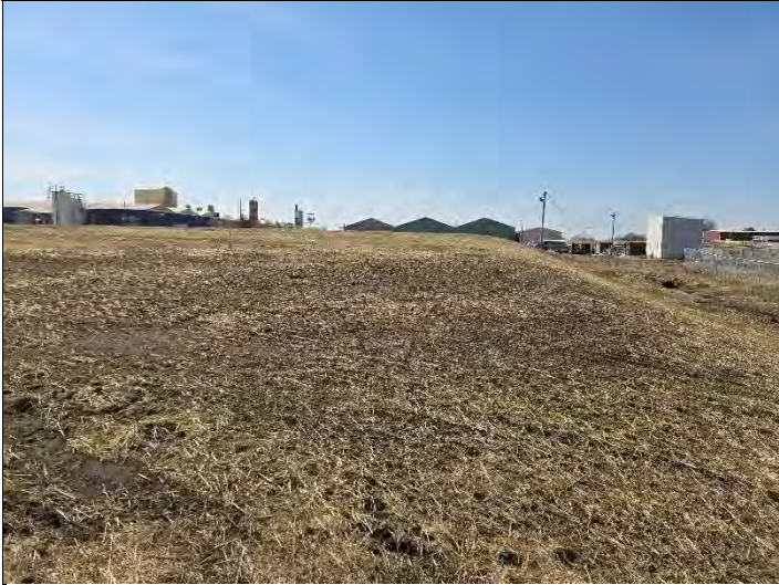
Date: 3/13/2025 Location: North looking West