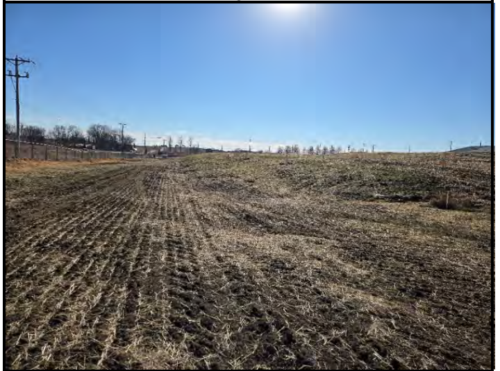
Date: 1/17/2025 Location: East side looking South