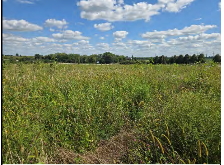
Date: 8/22/2025 Location: West looking East