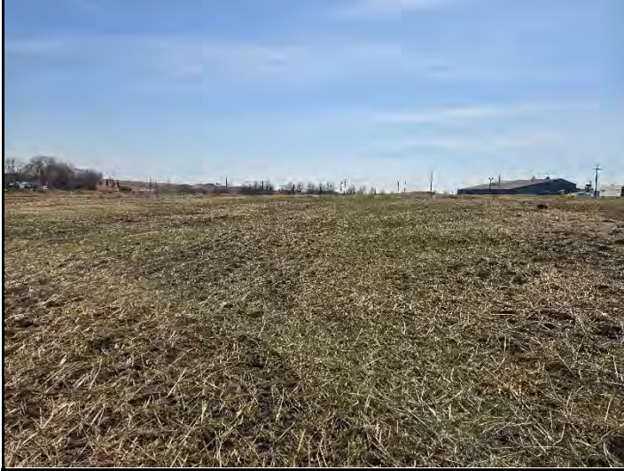
Date: 3/13/2025 Location: North looking South