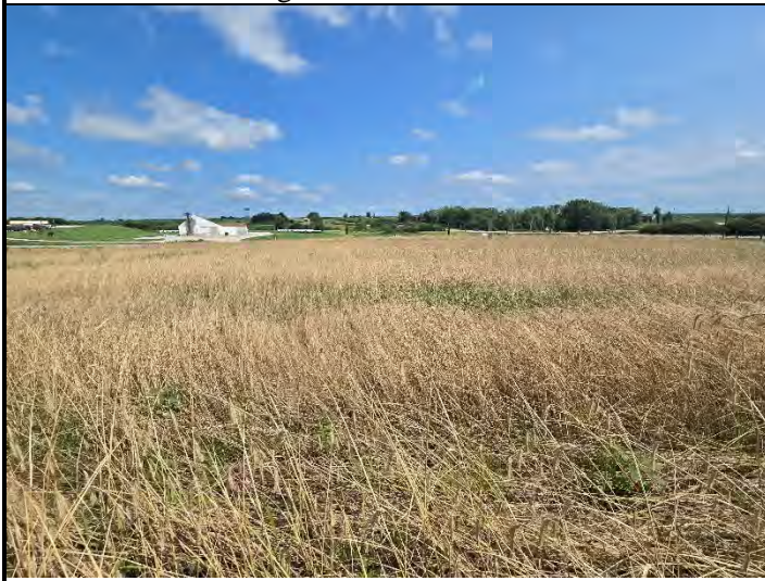
Date: 7/16/2025 Location: West looking East