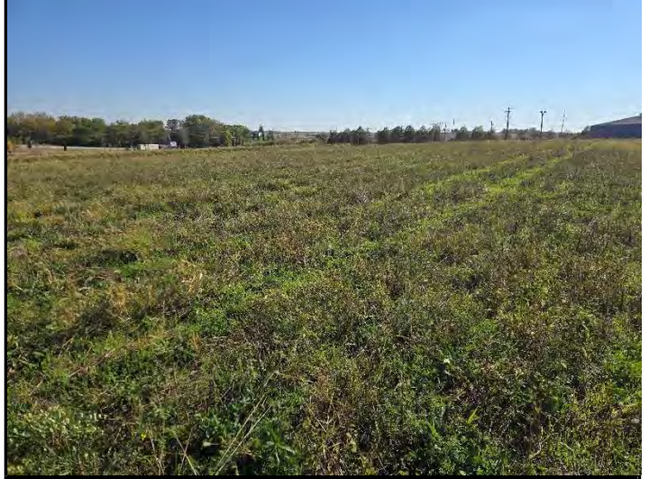
Date: 10/16/2025 Location: NW looking SE