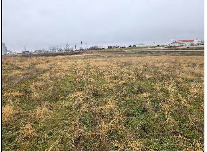
Date: 11/25/2025 Location: SW looking NE