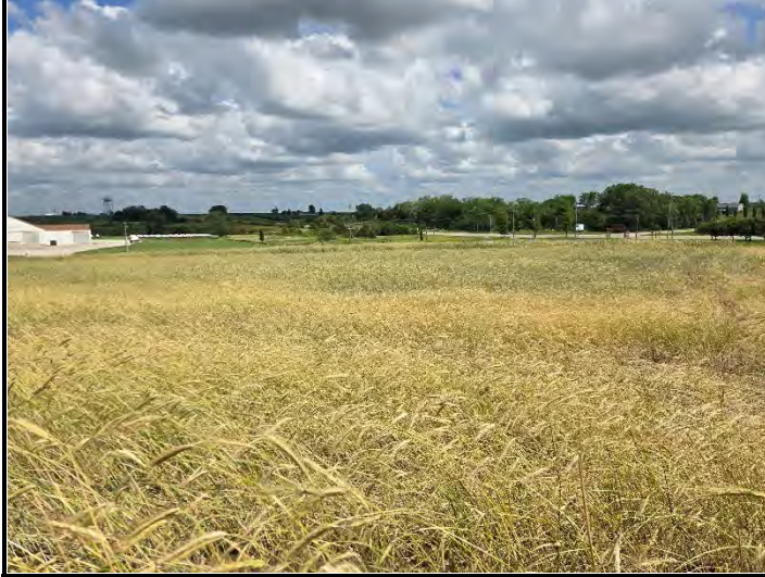
Date: 6/23/2025 Location: NW looking SE