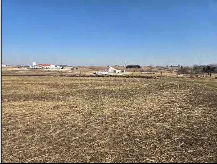
Date: 3/13/2025 Location: Northwest corner of West side looking East