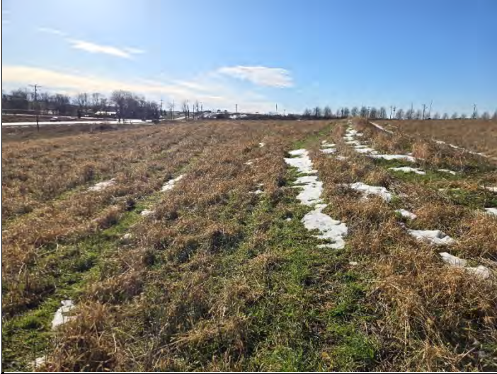
Date: 12/17/2025 Location: NE looking South