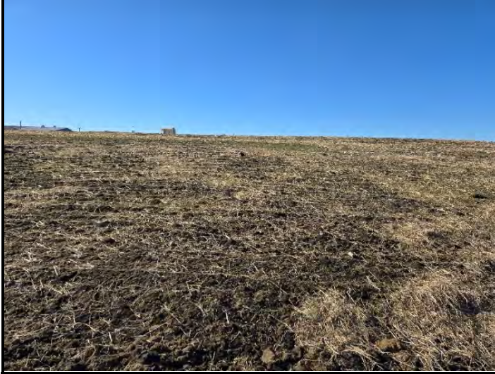
Date: 1/17/2025 Location: East side looking West