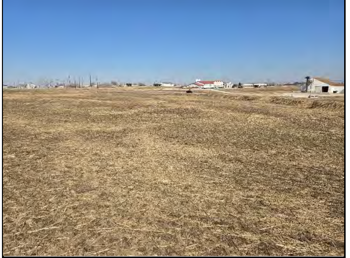
Date: 3/13/2025 Location: South looking Northeast