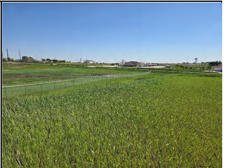
Date: 5/13/2025 Location: West looking NE