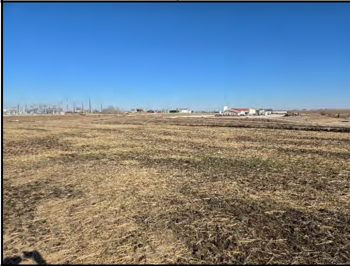
Date: 1/17/2025 Location: West side looking NE