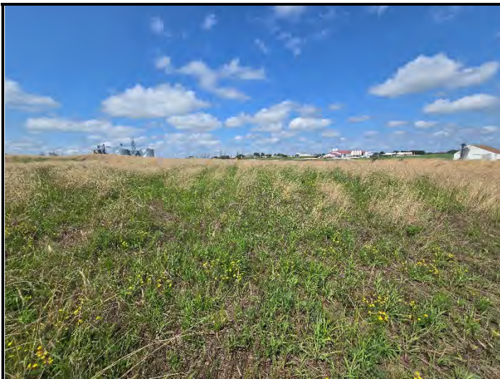
Date: 7/16/2025 Location: Middle looking NE