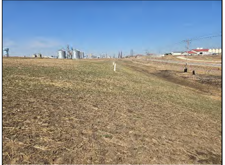
Date: 3/13/2025 Location: Southeast looking Northeast