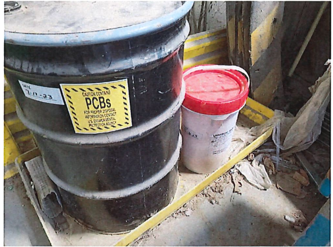
Mercury and PCB Storage Containers