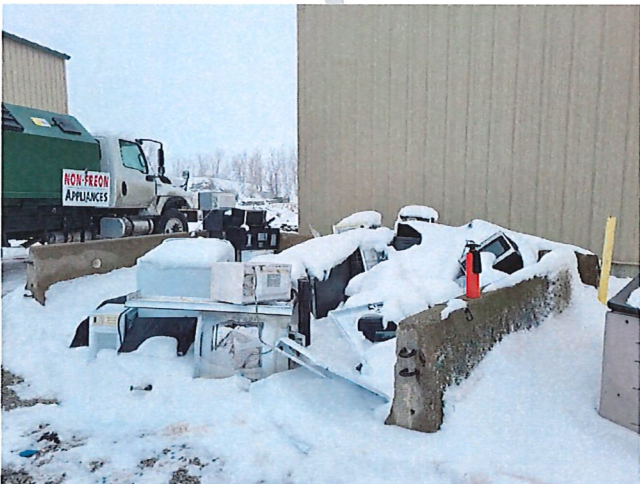
Non-Freon Appliances and Signage