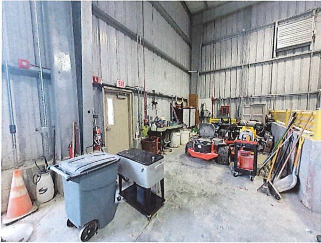
Appliance Demanufacturing Area