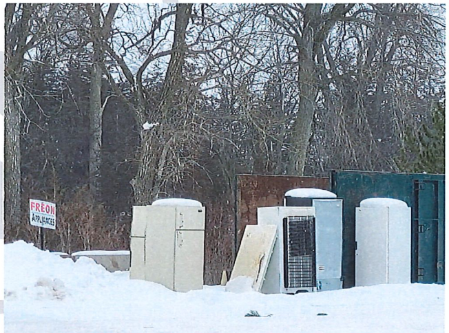
Freon Containing Appliances and Signage