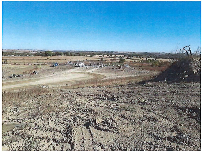
Tipplers w/ Bull Fencing