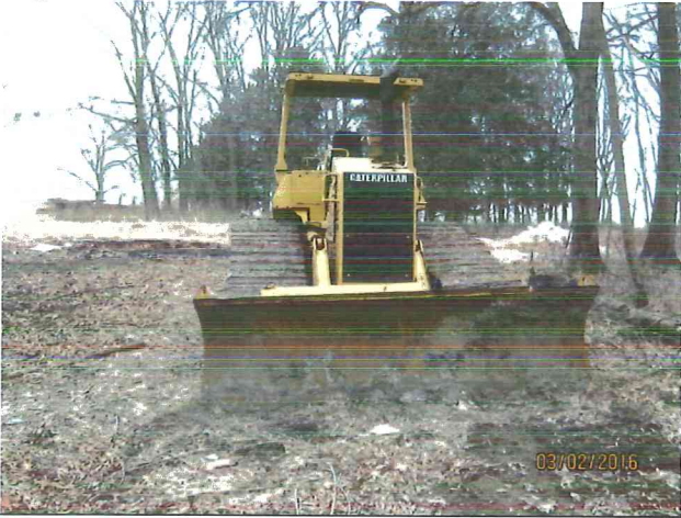
Dozer sitting adjacent to the ravine.