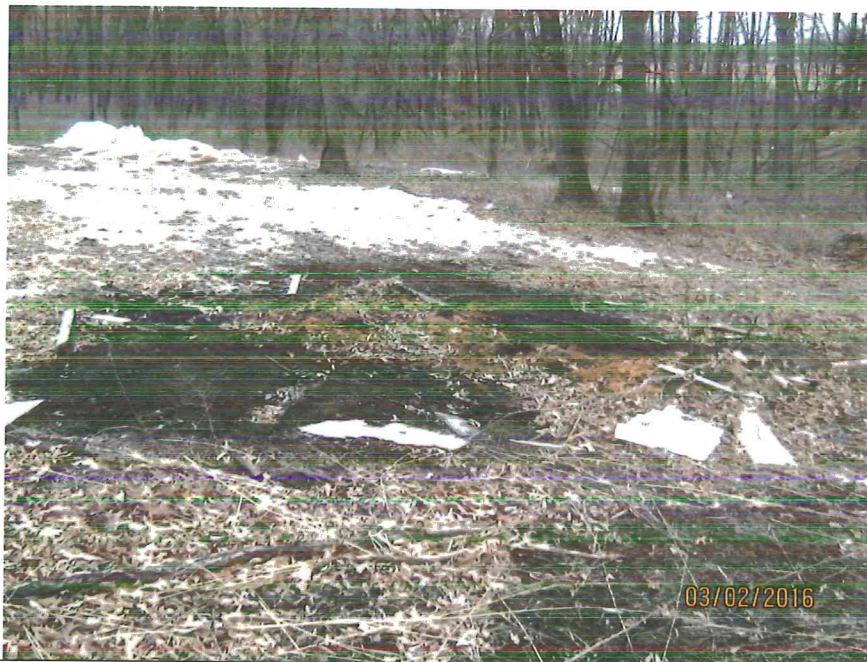
Burn pile, showing scraps of dimensional lumber, just up-gradient from the bulldozer (see next page #4). No dumping or burning was observed in this location during the 4/28/15 visit when all the other waste was observed just a few hundred feet to the east.