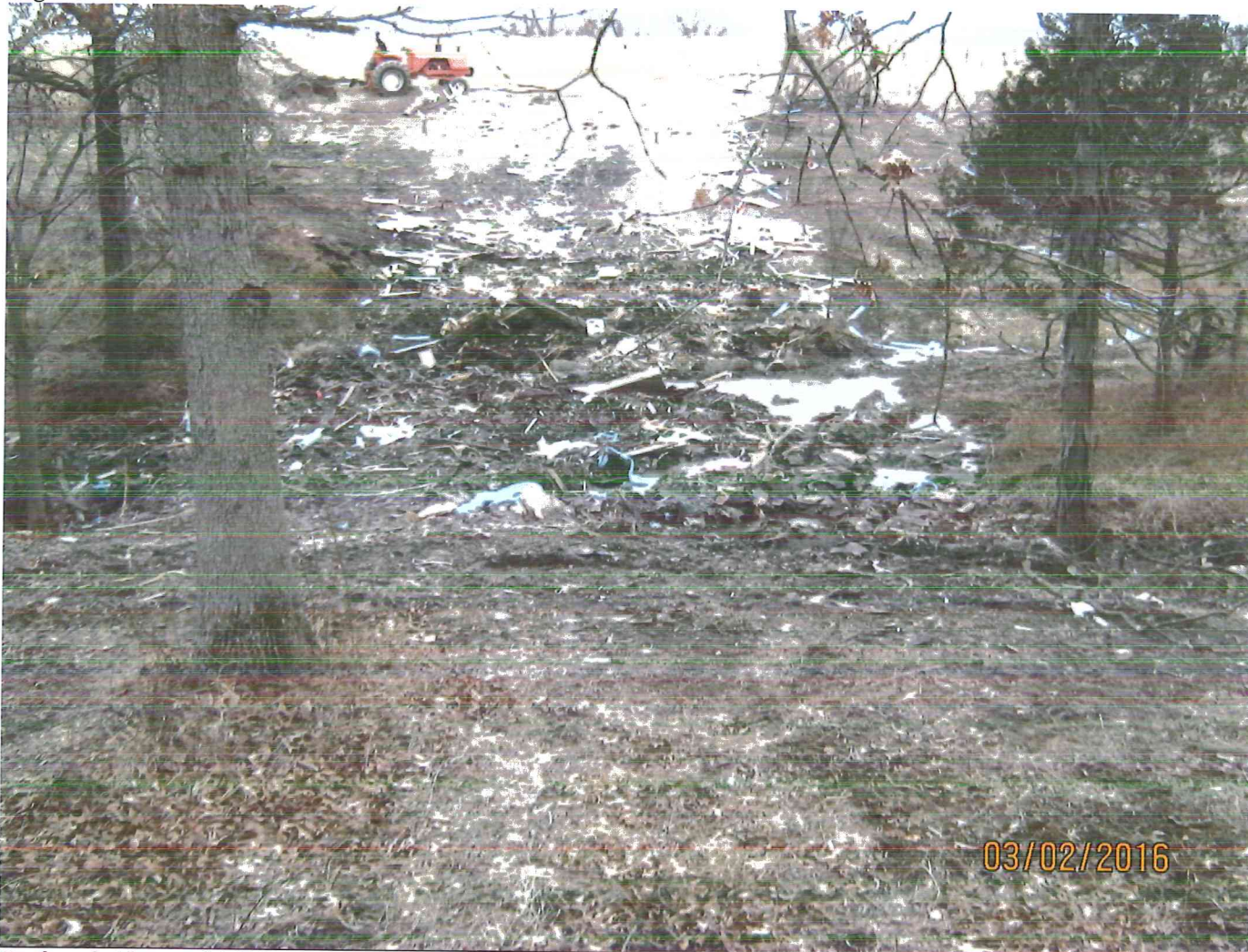
Much of the solid waste in the bottom of the ravine is asphalt shingles.