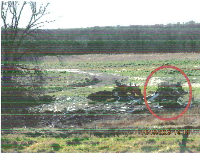
Photo taken 11/19/15

A photo with expanded view of this area is on the next page.