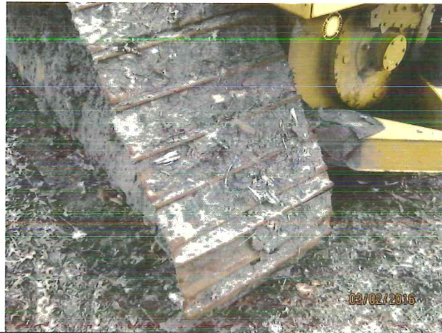
Notice the shingles imbedded in the mud on the track and on the yellow brace.

KRL:J:\FO6\SHARED\klevetz\SW\2016 SW\Sedore memo 3-2016.doc Picture Filenames: Sedore 3-2-16.jpg