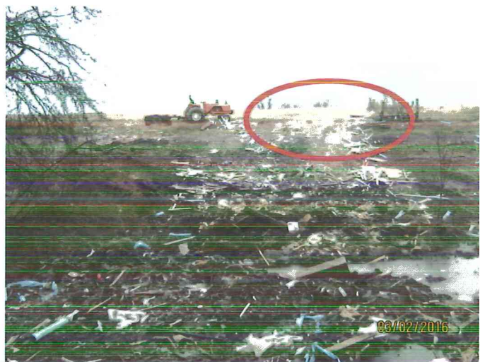
Photo taken 3/2/16