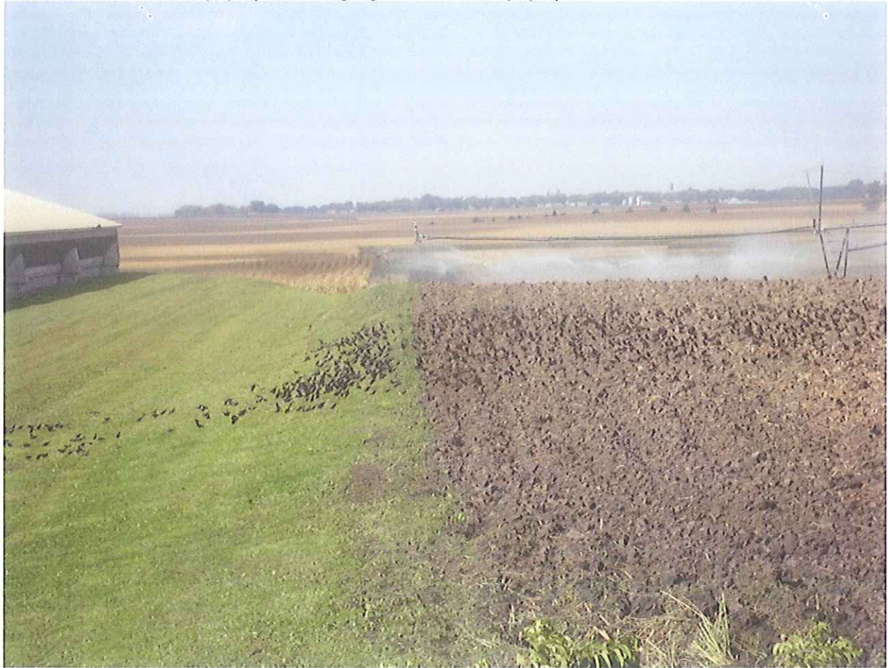
Picture from road down south property line showing irrigation within 50 ft of property line