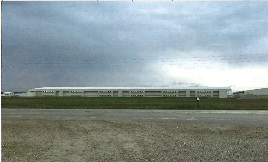
Photo taken by Kayla Beck of Iowa Cage Free where the incident occurred. Photo taken June 24, 2019 eastward facing.