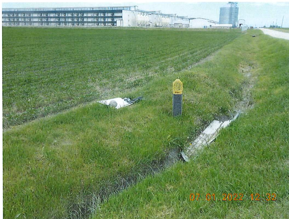
Tile intake on the west side of Deer Avenue (facing north/northwest toward the facility).