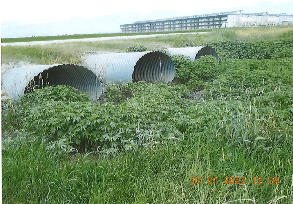
Three large culverts convey water from the grassed waterway under Deer Ave.

I also asked Mr. Epting about the construction status and burning activities at this site. He stated that they have completed the construction and cannot expand any further on this site without obtaining more land, which he did not believe would happen. He indicated that they are just cleaning up the site now. He stated that they always notify the sheriff's office whenever they are burning. I asked him what they burn and he stated that it was just clean wood like construction scrap and plywood crates from their cages.