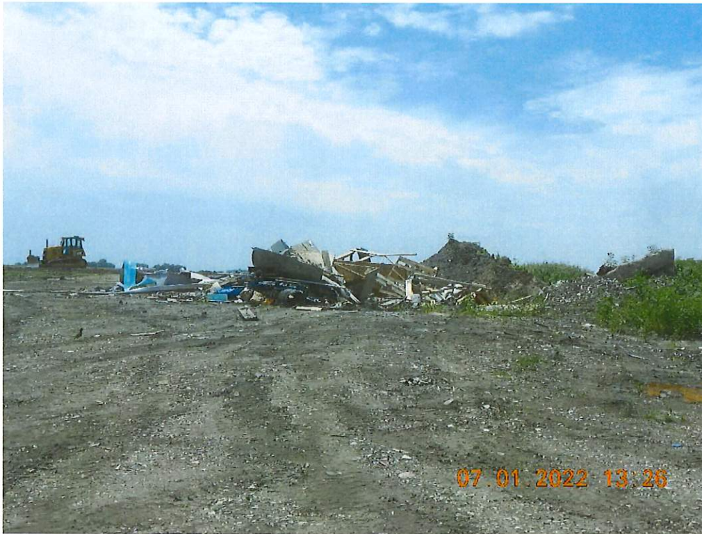
C&D wastes that have been burned and/or possibly buried on site.