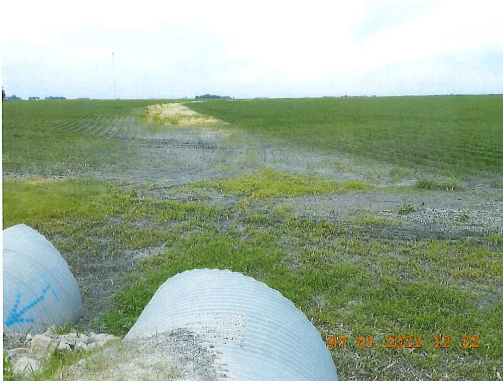
Grassed waterway facing west (upstream) from Deer Ave.

No runoff issues were observed and the following photos were taken: