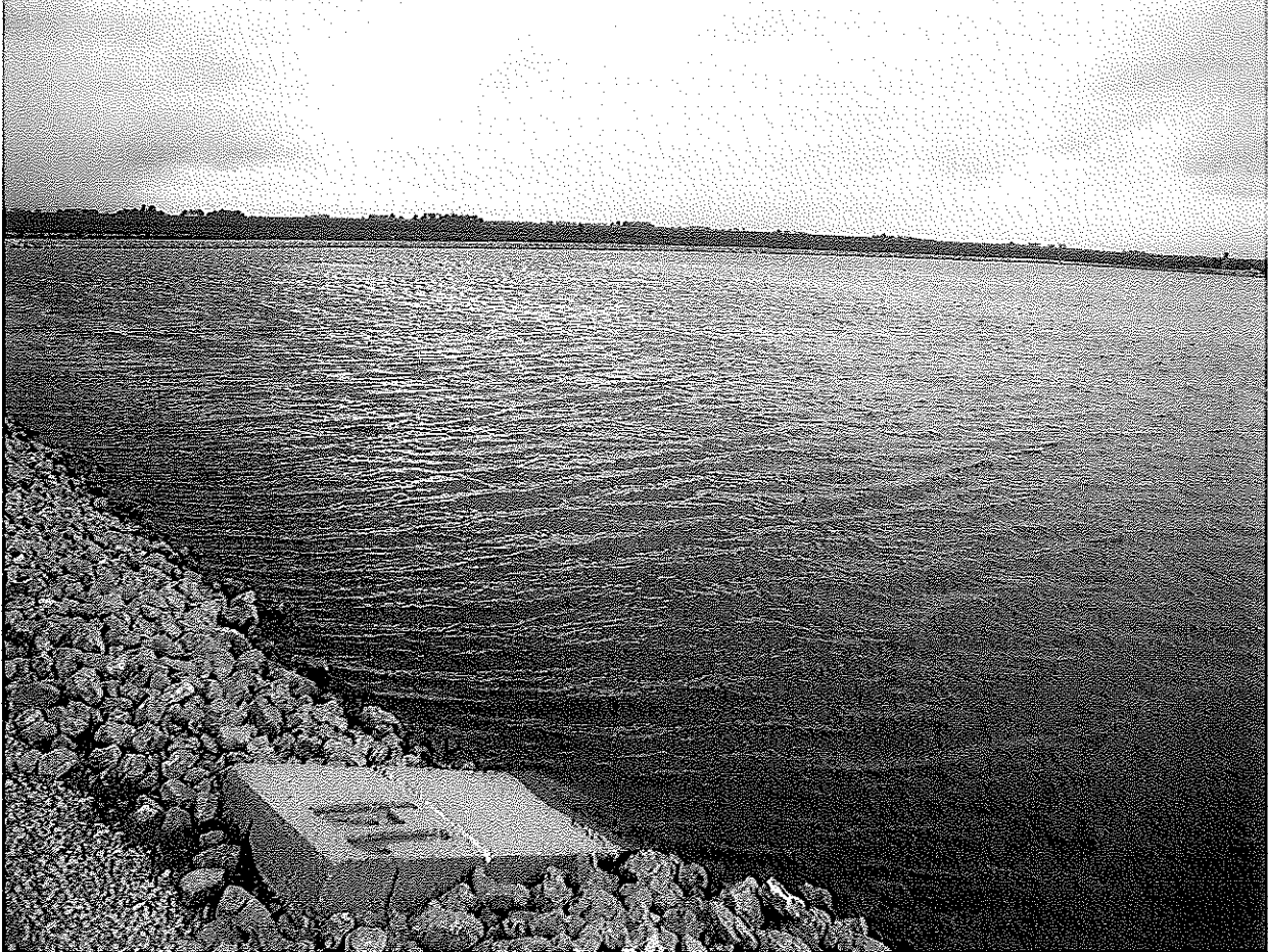
Storage Cell with 1 foot of freeboard remaining