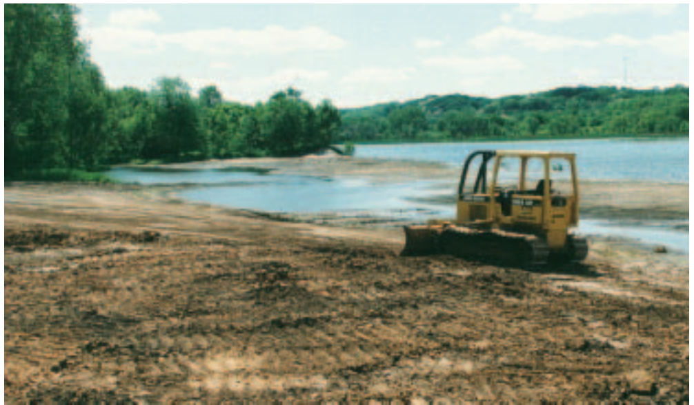
Bulldozer removing contaminated sediment from Nahant marsh.

The cleanup plan developed by the Service and EPA required the removal of the layer of marsh bottom sediments and shoreline soils that contained lead shot. This carefully planned removal of sediments was designed to leave the wetlands functioning properly. In addition, the depth of the marsh and shape of the shoreline were designed to enhance the value of the habitat for aquatic species and promote reestablishment of cattails and sedges.