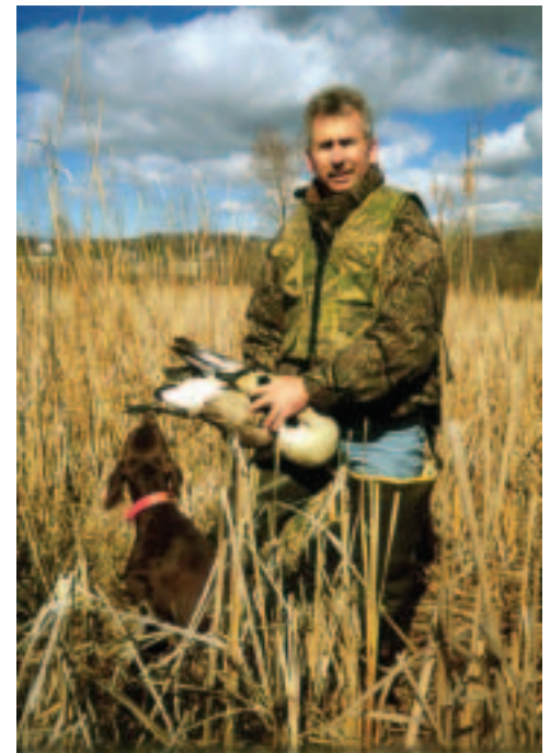
Service employee holds dead goose found in Nahant marsh.

The U.S. Environmental Protection Agency (EPA) joined the Service in the Nahant Marsh investigation because of potential threats to human health from lead exposure. As part of this investigation, the Service and the EPA worked together to evaluate current and future adverse effects of the lead