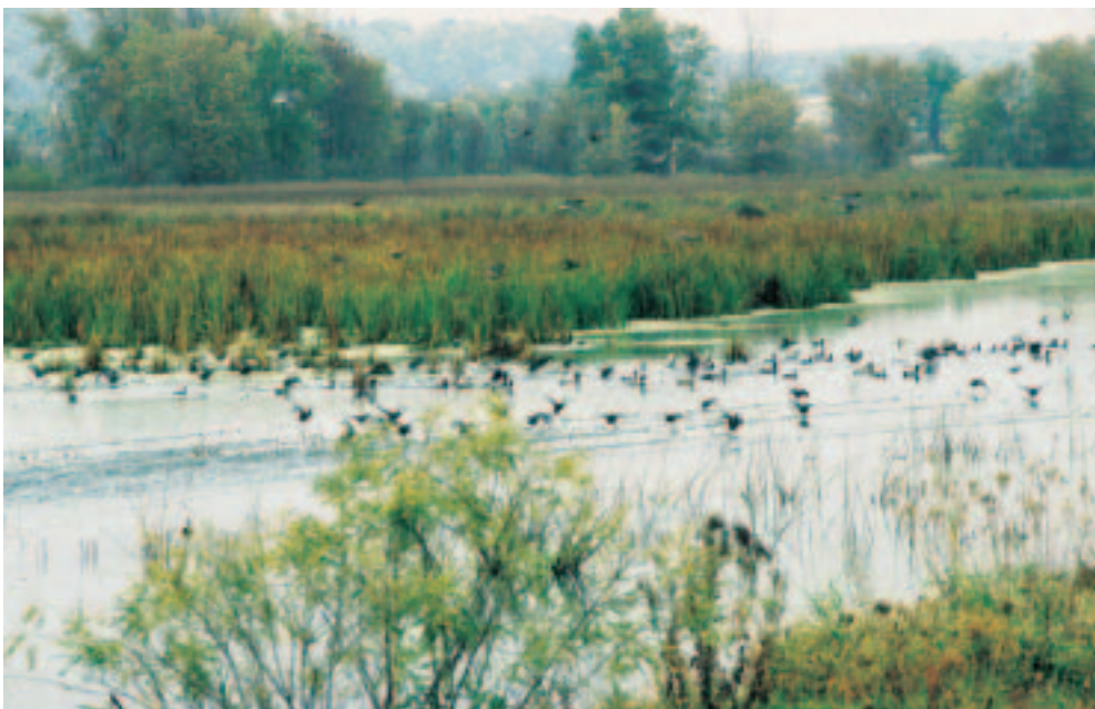
Nahant marsh just outside of the cleanup area. It is hoped the remediation area will look like this in a few more years.