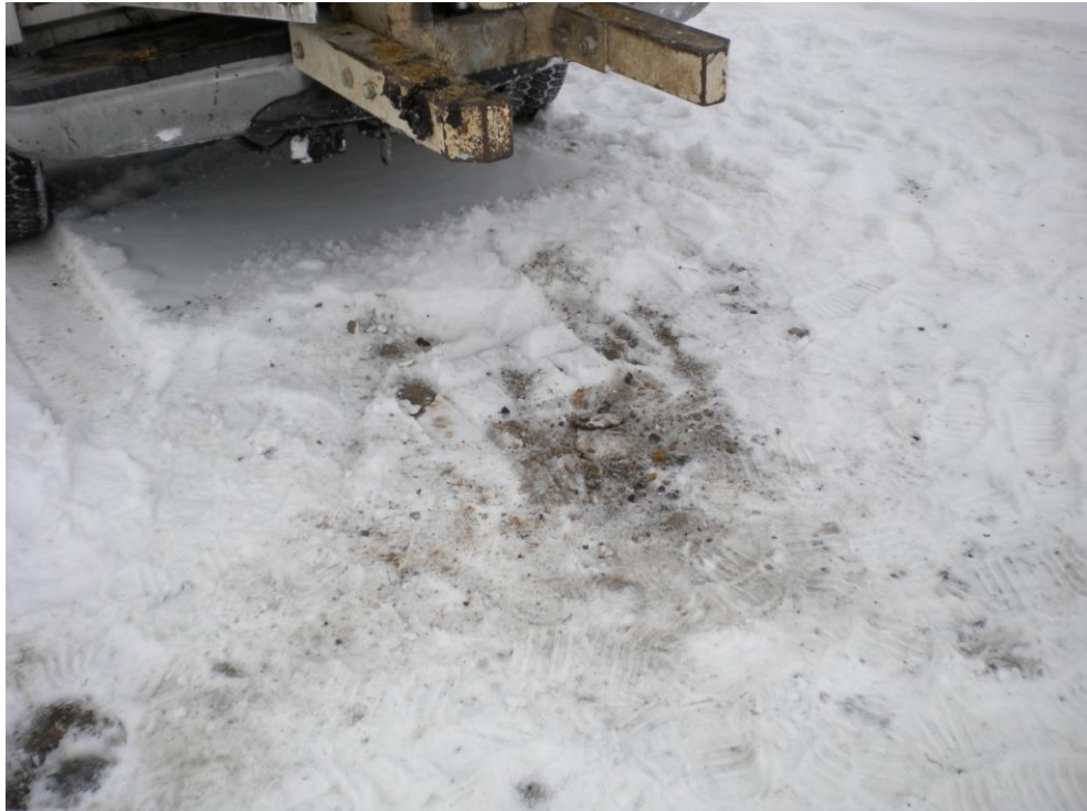
Site Photograph 3 – Boring location after drilling