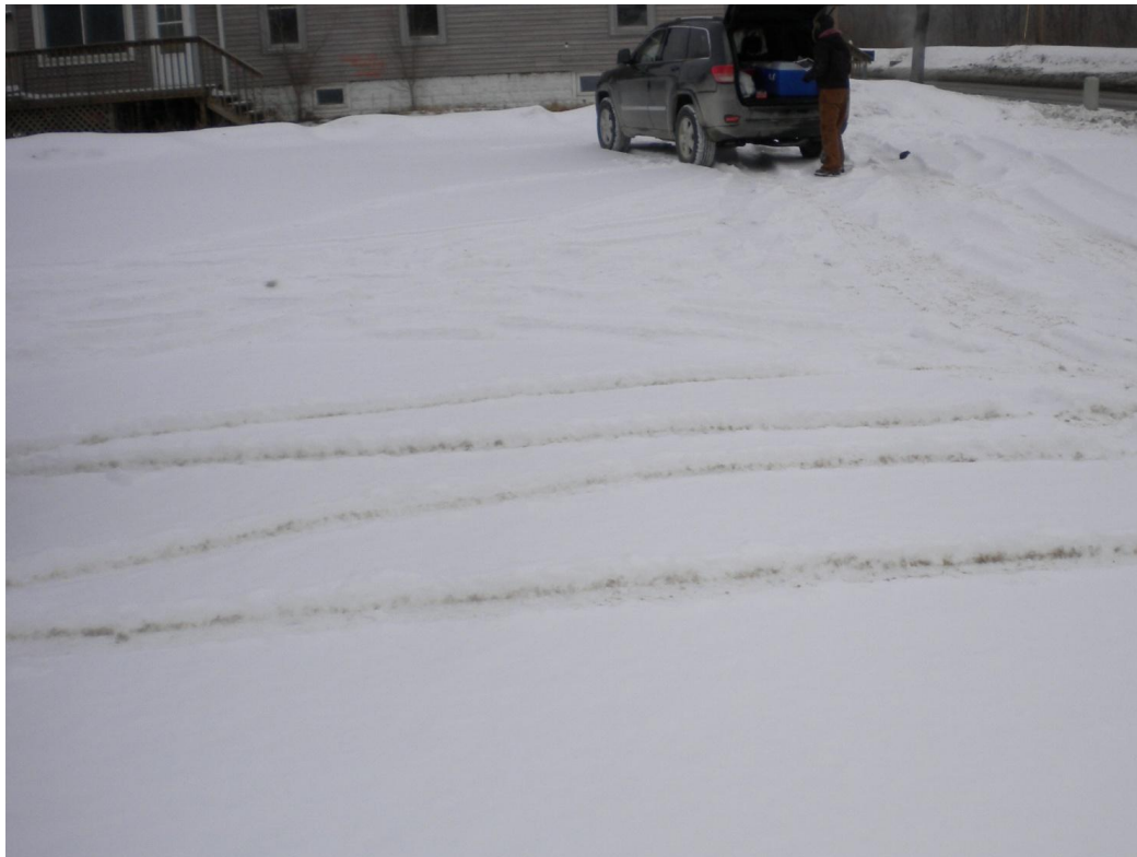
Site Photograph 2 – Boring location before drilling