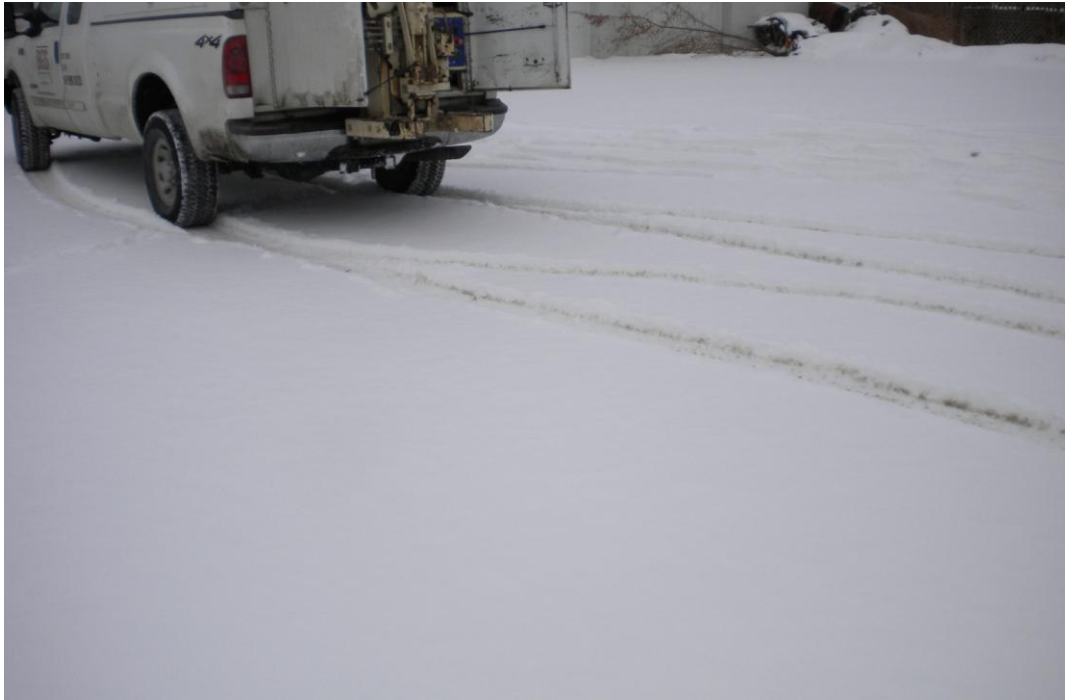
Site Photograph 1 – Boring location before drilling