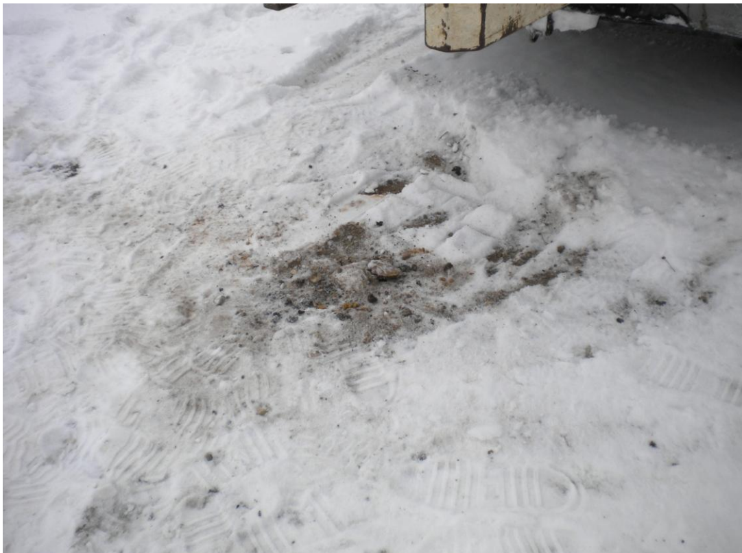
Site Photograph 4 – Boring location after drilling